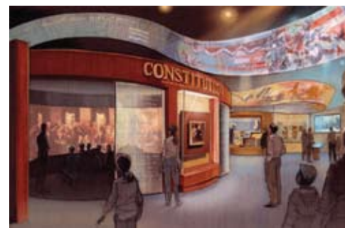
The attainment of "a more perfect union" through the Constitution will be depicted in a short film.

The "Revolution" theme encompasses exhibits about weapons and tactics, military commanders and ordinary soldiers, and the new United States on the world stage. Battles of the Revolution's Northern and Southern cam-