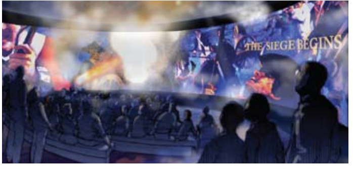
An experiential theater will transport visitors to the battlefield at Yorktown.

Guided by a master plan adopted in 2007 by the Jamestown-Yorktown Foundation Board of Trustees, the project replaces existing ticketing, exhibit and maintenance buildings with one approximately 80,000-square-foot structure and provides for enhancements to the museum's outdoor living-history areas. The new building is positioned on the site to allow for continued operation during construction.