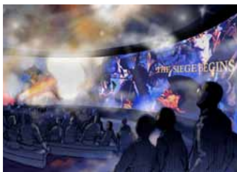
Private funding will support production of films for new museum exhibits, including an experiential theater that will transport visitors to the battlefield at Yorktown in 1781.

To learn more about urgent private funding needs, contact the Development Office at (757) 253-4139.