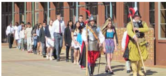
Members of the Jamestown Settlement Honor Guard and the George Wythe Society Children of the American Revolution (CAR) led participants to Jamestown Settlement's Robins Foundation Theater, where the Certificate of Citizenship ceremony took place.

Following the ceremony, participants and their families were invited on guided tours of Jamestown Settlement. ■