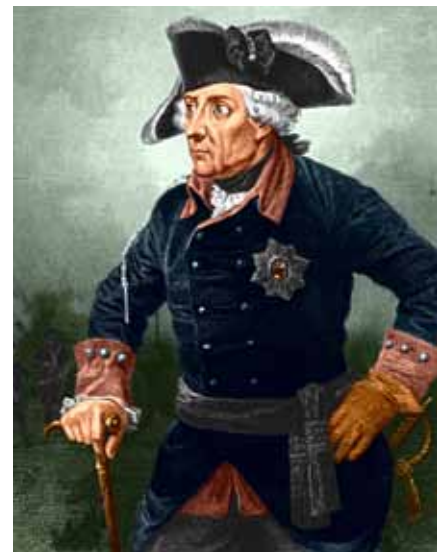
King Frederick the Great reformed the Prussian army, introducing new weapons and tactics. Public domain image.