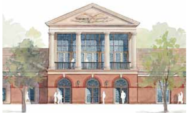
The distinctive two-story main entrance of the American Revolution Museum at Yorktown will serve as a focal point for arriving visitors.