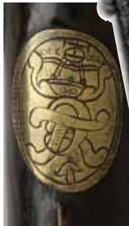
Each Prussian army musket had the letters FR (for King Frederick the Great) engraved on it, as exemplified in this 18th-century musket recently acquired for the Jamestown-Yorktown Foundation collection. The Prussians didn't want these "official" Prussian guns to get into the hands of the Americans, so they provided unmarked substitutes.