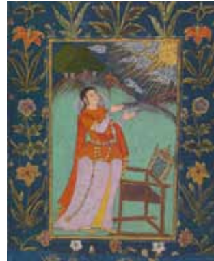
"Woman Raising Her Hands Towards the Sun," Golconda School (1650-60), Deccan (South India), 17th century, opaque watercolor on paper. Virginia Museum of Fine Arts, Kathleen Boone Samuels Memorial Fund.

A watercolor from India depicting a woman in European-style dress is one of several artworks exhibited in Jamestown Settlement's "The 17th Century: Gateway to the Modern World" that reflect international trading connections. The