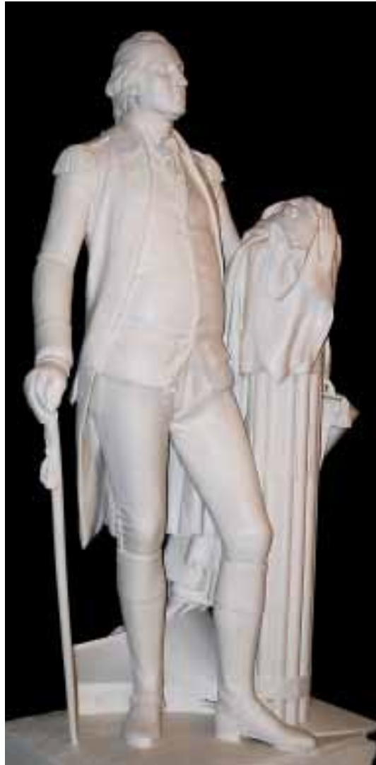
Hubard statue of George Washington after conservation by the Jamestown-Yorktown Foundation.

Houdon traveled to Washington’s Mount Vernon estate in Virginia, where he executed clay life models and a plaster life mask to serve as models for the statue, created between 1786 and 1795. Houdon portrayed Washington as a modern Cincinnatus, the Roman farmer who left his land to fight for his country and, after victory as a general, returned to his farm as a man of simplicity and peace. He