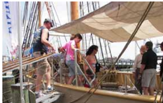
The Godspeed hosted 3,000 visitors at Norfolk Harborfest last year.

Yorktown, an affiliate port with OpSail 2012 Virginia, is the setting for Yorktown Maritime Weekend Friday through Sunday, June 1-3. The Godspeed , along with the Spirit of Bermuda