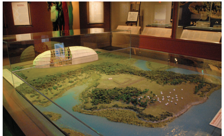
The Werowocomoco site is depicted in a scale model in the center of Jamestown Settlement's "Werowocomoco: Seat of Power" exhibition, in place through June 2011. A building discovered by archaeologists at a distinct part of the site thought to have been used for high-status social and ceremonial functions is included in the model and re-created on a larger scale next to it.

Advance reservations for "Powhatan Indian World" and other group programs can be made by calling toll-free (888) 868-7593. ■