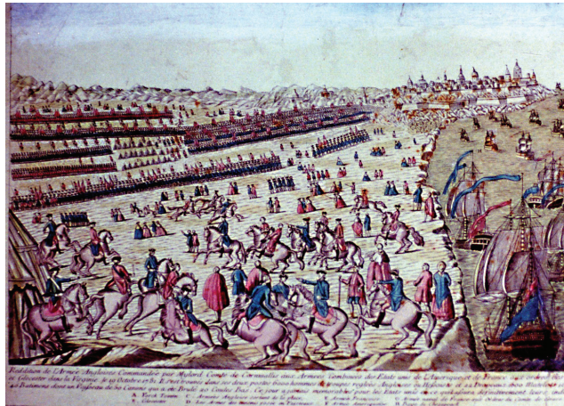
This 18th-century French engraving depicts the October 19, 1781, British surrender at Yorktown to allied American and French forces.

Early in 1781 the war had finally come to Virginia. First