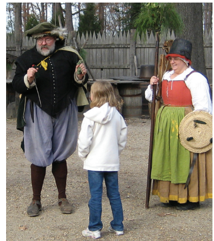
The "Lord of Misrule" engages a visitor during "A Colonial Christmas," one of the special programs at Jamestown Settlement supported by a James City County grant. "A Colonial Christmas" is presented at Jamestown Settlement throughout December and also is a monthlong theme at the Yorktown Victory Center.

For information about supporting programs of the Jamestown-Yorktown Foundation, call (757) 253-4139 or visit www.historyisfun.org/giving . ■