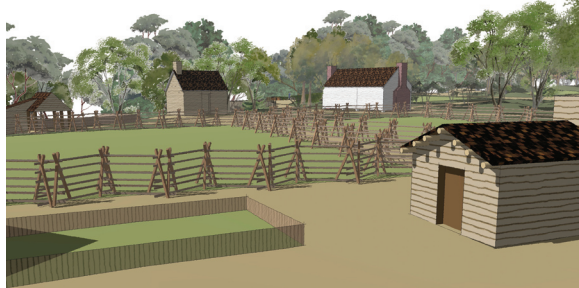
Artist's renderings depict the future appearance of the encampment (above) and farm (left).

be positioned on the site with a distinctive two-story main entrance and plaza directly facing the roadway entrance. Its location allows for continued museum operation during the construction process.