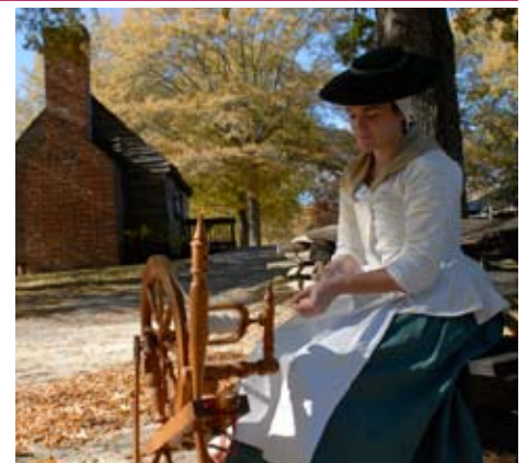
Spinning is one of the activities planned for the Yorktown Victory Center's "Court Day" event on September 17.

Both museums offer holiday programs in late fall. Historical Virginia foodways are featured during "Foods & Feasts of Colonial Virginia" November 24-26, and 17th- and 18th-century holiday traditions during "A Colonial Christmas" December 1-31. ■