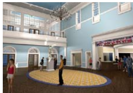
Recent major gifts support the Yorktown Victory Center replacement project, for which architectural planning is nearly complete. This artist’s rendering depicts the entrance lobby in the new building.

A grant of $10,000 from the Charles S. and Millicent P. Brown Family Foundation funds the Jamestown-Yorktown Foundation’s elementary school scholarship