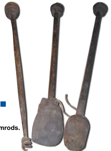
Three of 13 cannon ramrods.