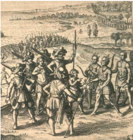
Powhatan's capital Matchcot is shown in the upper right corner of a 17th-century engraving in the collection of the Jamestown-Yorktown Foundation. The engraving depicts Pocahontas, surrounded by Englishmen, meeting several of her brothers in March 1614.

English demands but did consent to a marriage between Pocahontas and John Rolfe. Soon the war ended, and later that year Powhatan told Ralph Hamor that he was old, and would gladly end my days in peace, so as if the English offer me injury, my country is large enough, I will remove myself farther from you. In his old age, Powhatan began to relinquish his dealings with the English to his brother Opechancanough.