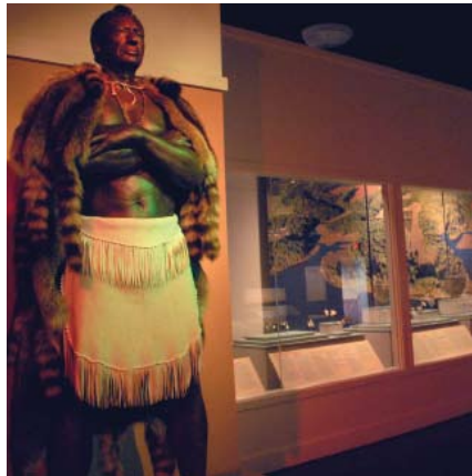
A statue of Powhatan, paramount chief of 30-some Indian tribes in Virginia’s coastal region at the time English colonists arrived in 1607, stands next to artifact cases in Jamestown Settlement’s “Werowocomoco: Seat of Power” exhibition.

examine the legacy of an iconic 17th-century Angolan leader. “Seed to Stalk” theme month at both museums in June explores early American agriculture, and “Tools of the Trade” in August highlights implements and processes used in farming, fishing, hunting, defense, maritime navigation and construction.