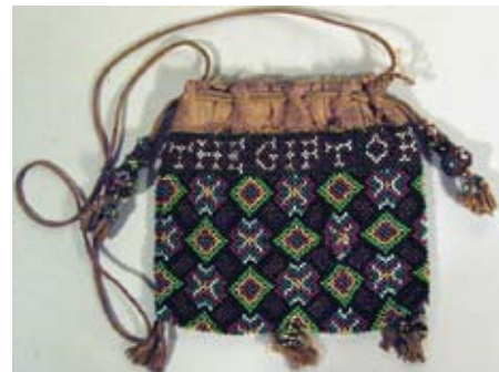
English beaded purse, 1628

Thirty of the registrants at a March symposium co-sponsored by Colonial Williamsburg and the Costume Society of America will have a rare behind-the-scenes look at 17th- and 18th-century costumes and accessories in the collection of the Jamestown-Yorktown Foundation. The March 13-16 symposium, "Costume Accessories: Head to Toe," complements Colonial Williamsburg's DeWitt Wallace Decorative Arts Museum exhibition "Fashion Accessories from Head to Toe."