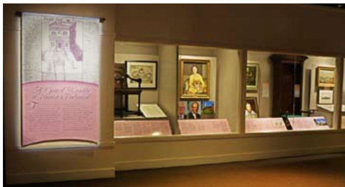
A section of the "Virginia Company Colonies" exhibition chronicled the evolution of government in Virginia and Bermuda.

Information about "Jamestown and Bermuda: Virginia Company Colonies" and other Jamestown-Yorktown Foundation special exhibitions is available in a new section of www.historyisfun.org , "Collection and Exhibitions."