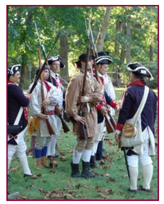
American soldiers drilling.

The battle lasted only thirty minutes. Colonel Woodford reported to the Committee of Safety there were no American casualties and only one American was wounded in the hand. There are different estimates as to the number of British losses. In addition to the brave Captain Fordyce, the British suffered the death of two lieutenants. Colonel Woodford also reported twelve British privates died. A lieutenant and seventeen privates were taken as prisoners. When night fell, the British abandoned their fort and retreated to Norfolk. Colonel Woodford reported that Great Bridge was "a second Bunker's Hill, in miniature, with this difference that we kept our post and had only one man wounded in the hand."