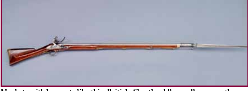
Muskets with bayonets like this, British, Shortland Brown Bess were the primary weapon of the Revolution, Jamestown-Yorktown Foundation.

up Virginia's rivers and raid rebel plantations for provisions whenever he wanted. These raids also gave him an opportunity to free blacks which he enlisted into his new Ethiopian Regiment.