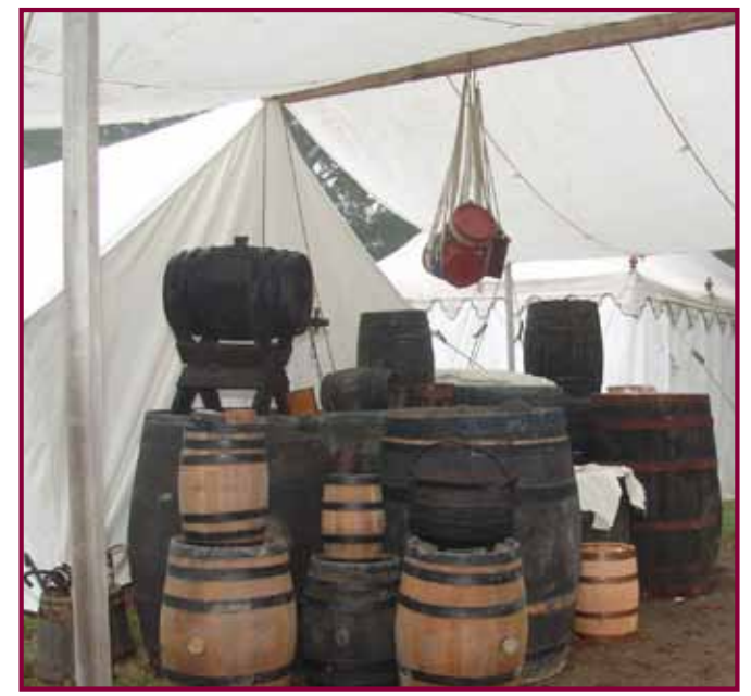
Virginia served as a major source of army supplies during the war.

The strategic aspects of the battle cannot be underestimated. The battle forced the British into a defensive posture in Virginia. Lord Dunmore and his fleet left Virginia within seven months of the Battle of Great Bridge. British forces would not return to Virginia until May 1779 when the British conducted a major naval raid against Hampton Roads. During this critical three year period, Virginia served as a major resource for resupplying materials and men to Washington's armies. Without British interference, food and war materials from eastern North Carolina and Tidewater Virginia moved up the Chesapeake Bay to keep the American war effort alive.