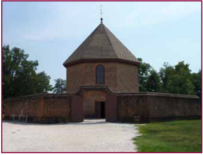
Magazine in Colonial Williamsburg's Historic Area. British marines seized gunpowder from this magazine in April 1775.

With few British troops at his disposal, the Royal Governor had little power to stop the rise of the provisional government. In April 1775, British Marines seized the gunpowder in the Magazine in Williamsburg. During this same