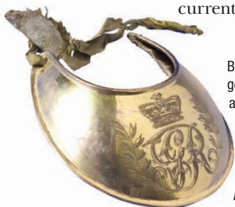
British officer's gilt brass gorget, engraved with a crown and the initials "GR." The gorget dates to the second half of the 18th century. Jamestown-Yorktown Foundation collection.

Our collections and our mission are intertwined. We cannot be truly successful as an institution of public education unless we can acquire and conserve artifacts that illustrate the complex stories of our nation's early history. Our goal: to acquire artifacts for their ability to tell a compelling and important story. After more than a decade spent building the collection of 17th-century artifacts for Jamestown Settlement, we have turned our focus to strengthening the collection of the Yorktown Victory Center. This past year, gifts and grants to our Yorktown Victory Center acquisitions program helped bring us one-third of the way toward that program's current $2.5 million goal.