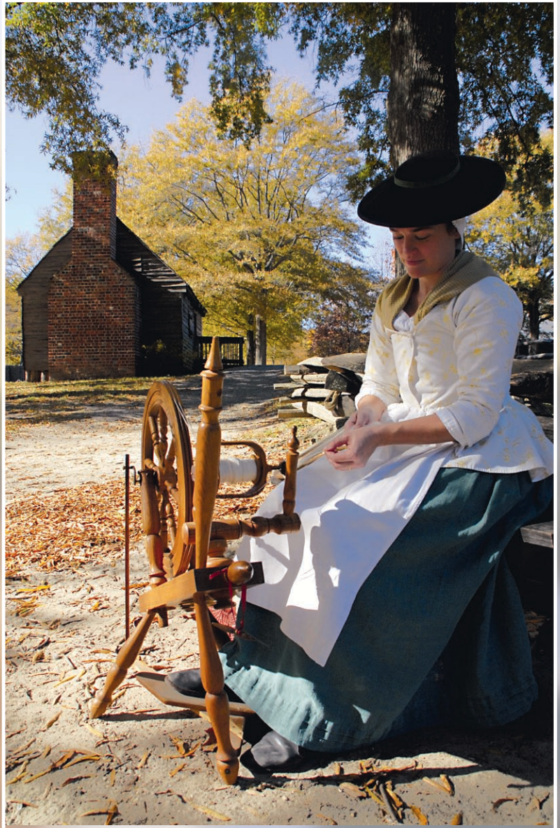
Reproductions of 18th-century farm and household tools are an integral part of the visitor experience in Yorktown Victory Center's re-created 18th-century farm.

"If [my] 7-year-old daughter says that a history museum is fun, you know you're doing a great job! She's a tough critic!"