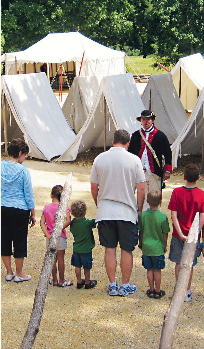
The Yorktown Victory Center is being transformed into a museum of national significance for its power to bring the entire story of the American Revolution to life to teach the stories of the people, places, and principles that forged our nation.

The Jamestown-Yorktown Foundation, Inc., Board of Directors has to date embraced approximately $5 million needed to help create the experiences for visitors, schoolchildren, teachers, and distant learners to understand the Revolution's legacy for us today – our democracy, our liberties, and our duties as citizens.