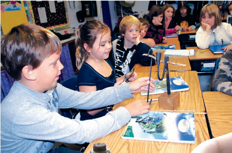
Fourth-grade students try and figure out how to use a rush lamp, a typical form of lighting available to Jamestown colonists in the 17th century, during the Jamestown-Yorktown Foundation outreach program “Life at Jamestown.”

Over the course of four years the Foundation has partnered with [Hampton City Schools], student achievement in Social Studies has risen from below average pass rates on the Virginia Standards of Learning to the point where we have achieved a milestone: for the first time, 100% of our K-12 schools are fully accredited in social studies. One barrier stemmed from our teachers’ unfamiliarity with creative ways to teach the difficult concepts of Virginia’s colonial beginnings. The Jamestown-Yorktown Foundation has been instrumental in helping us eliminate those barriers and make full accreditation a reality!