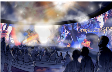
Exhibit design concepts for immersive environment and experiential theater.