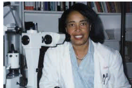
Patricia Bath, M.D.: Apparatus for Ablating & Removing Cataract Lenses