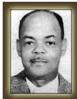
Otis Boykin: invented an improved electrical resistor used in computers, radios, television sets and a variety of electronic devices.