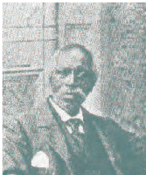
Thomas Elkins: patented this refrigerated apparatus on November 4, 1879 and had previously patented a chamber commode in 1872 and a dining, ironing table and quilting frame combined in 1870

Information taken from http://inventors.about.com/od/