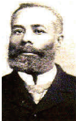
Elijah McCoy: the portable ironing board, tire tread, and the lawn sprinkler