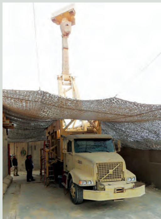
DS SECURITY ENGINEERS CONSTANTLY MONITOR THE INFORMATION FROM THE SENSE-AND-WARN SYSTEM IN IRAQ.

DS has a substantial role in the security of personnel within the United States, as well. DS teams manage physical security upgrades at more than 140 Department locations within the United States. In the domestic security arena, DS replaced numerous pieces of perimeter protection equipment; and three projects to provide technical security countermeasures at the National Passport Center (NPC) also were completed.