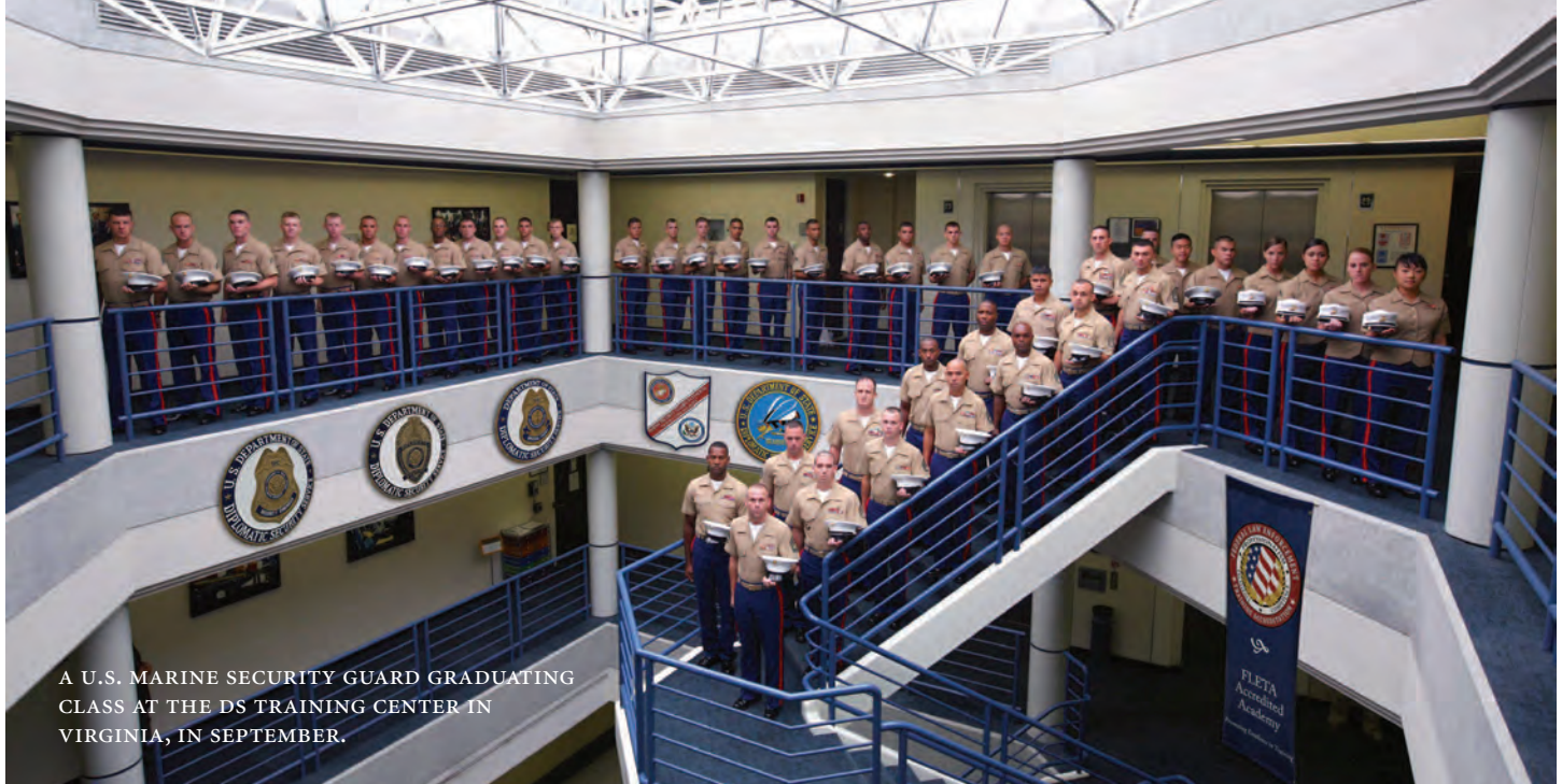
A U.S. MARINE SECURITY GUARD GRADUATING CLASS AT THE DS TRAINING CENTER IN VIRGINIA, IN SEPTEMBER.