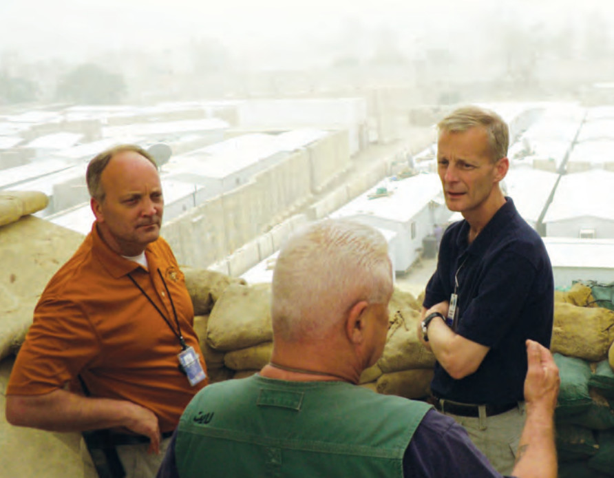
IN THE INTERNATIONAL ZONE IN BAGHDAD, IRAQ, A DS PHYSICAL SECURITY SPECIALIST (CENTER FOREGROUND) BRIEFES THE U.S. EMBASSY RSO (LEFT) AND THE DIRECTOR OF THE DIPLOMATIC SECURITY SERVICE (RIGHT) DURING A TOUR OF FORWARD OPERATING BASE PROSPERITY ON MAY 18.

Strains in bilateral diplomatic relations presented special challenges for routine RSO operational duties and procedures.