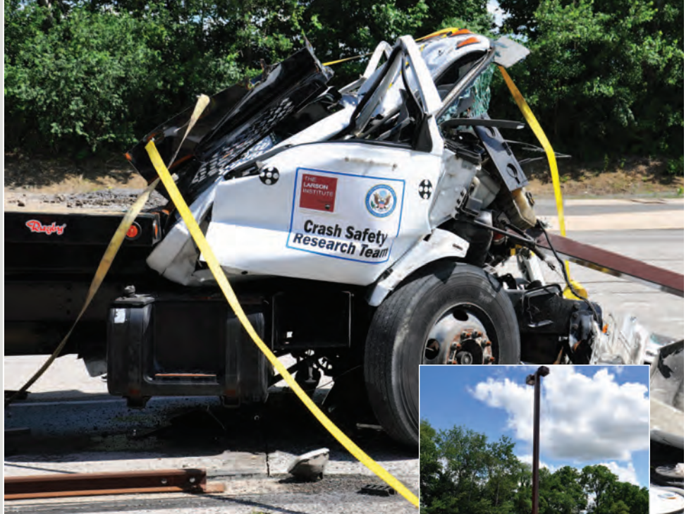
DS ANTI-RAM LAMP POST PRIOR TO THE RAMMING TEST (INSET AT RIGHT) AND AFTERWARDS (TOP)

DS is a leader in the field of physical security, especially as it applies to expeditionary protection overseas. Major strides have been made in anti-ram and blast-mitigation programs. Full-scale load-bearing masonry blast tests were conducted to demonstrate the benefits of whole building retro-fit technology against live explosives.