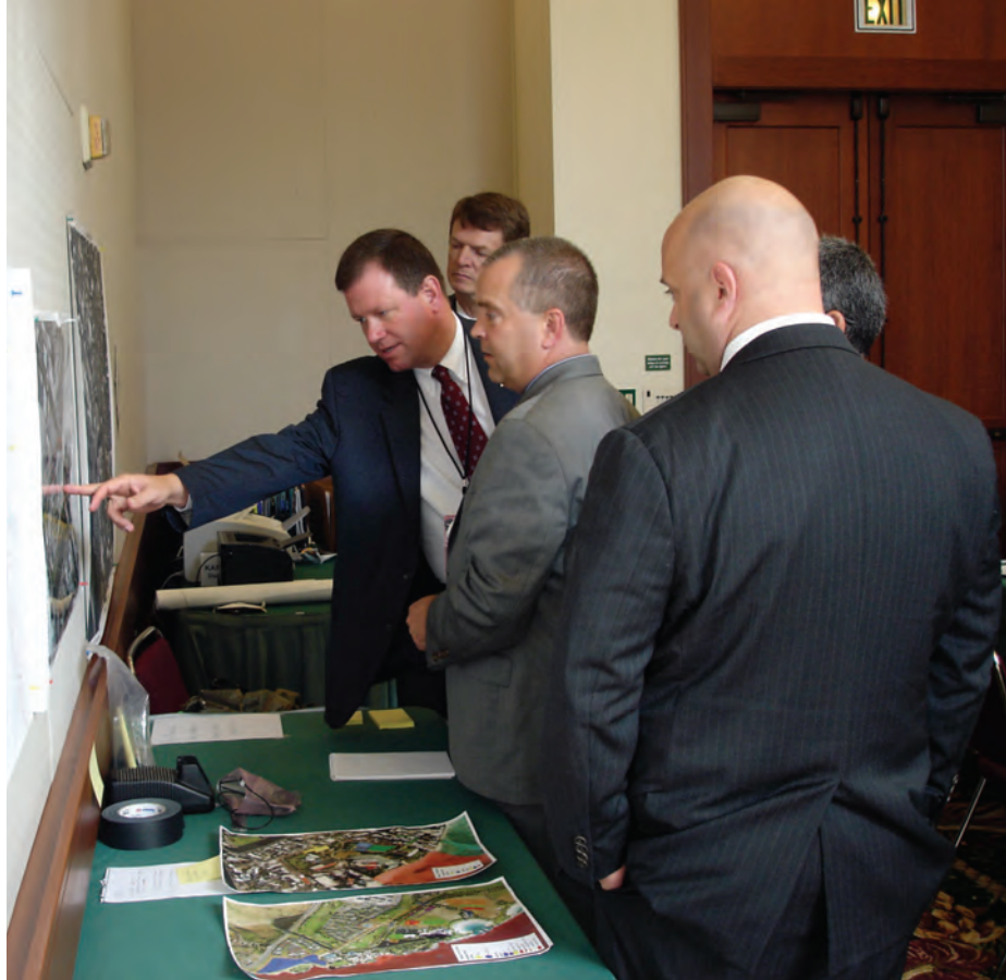
AT THE NOVEMBER ASIA PACIFIC ECONOMIC CONFERENCE IN HONOLULU, HAWAII, THE DS DIRECTOR OF PROTECTION FOR VISITING HEADS OF STATE (POINTING) REVIEWS A MAP OF CITY SECURITY CHECKPOINTS WITH OTHER SENIOR DS SECURITY OFFICERS.

Pursuant to the requirements of the Foreign Missions Act, the Office of Foreign Missions (OFM) has four primary roles: (1) to regulate the activities of foreign missions in the United States and its territories in a manner that will protect the foreign policy and national interests of the United States; (2) to use reciprocity as a means to adjust for costs and procedures faced by U.S. diplomatic missions abroad; (3) to protect the