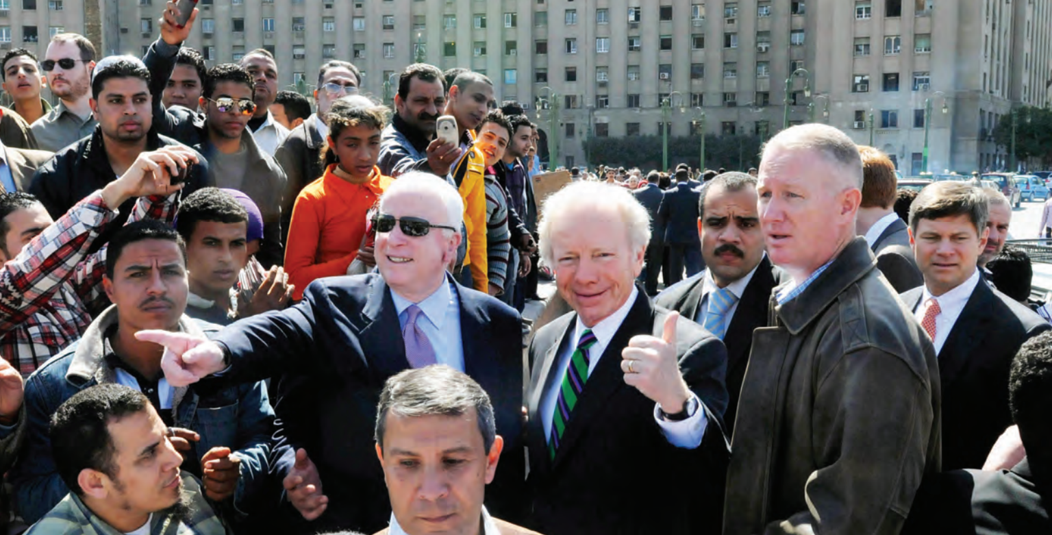
U.S. SENATORS JOHN MCCAIN (CENTER LEFT) AND JOSEPH LIEBERMAN (CENTER RIGHT) TALK TO EGYPTIANS GATHERED IN TAHRIR SQUARE IN CAIRO, THE FOCAL POINT OF THE EGYPTIAN PRO-DEMOCRACY UPRISING, ON FEBRUARY 27. THEY ARE PROTECTED BY THE DS REGIONAL SECURITY OFFICER (STANDING BESIDE SENATOR LIEBERMAN ON RIGHT) AND BY OTHER DS SPECIAL AGENTS (AMONG THEM, LEFT EXTREME REAR WITH SUNGLASSES, AND FAR RIGHT EXTREME REAR, PARTIALLY HIDDEN).

by angry mobs with knives, swords, and various homemade weapons. There were several close calls where U.S. mission personnel barely escaped the attacks, and they did so only after sustaining significant and potentially debilitating damage to the armored vehicles, including broken windows, flattened tires, and body damage. U.S. personnel also had some close calls at the U.S. Embassy. With the potential for grave consequences, the RSO enforced strict procedures for anyone moving about the compound, including some areas where only limited personnel with RSO approval and mandatory ballistic protection were permitted.