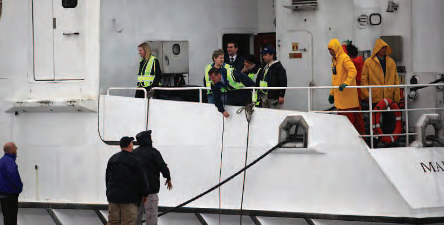
THE STATE DEPARTMENT-CHARTERED FERRY MARIA DOLORES ARRIVES IN TRIPOLI ON FEBRUARY 23, TO EVACUATE U.S. EMBASSY PERSONNEL TO MALTA. ASSISTING ON THE PIER ARE TWO U.S. EMBASSY TRIPOLI ASSISTANT RSOs AND THE RSO. AMONG THOSE ABOARD THE FERRY IN GREEN VESTS ARE A U.S. EMBASSY FRANKFURT DEPUTY RSO AND A U.S. EMBASSY ROME ASSISTANT RSO.

During the crisis, RSO Manama fully integrated senior U.S. Department of Defense (DoD) leadership into the Embassy's emergency planning and actions. As a result, the U.S. Navy's Central Command headquarters in Bahrain aligned its security posture and travel guidance for its 9,000 personnel and dependents with that of the U.S. Embassy. Throughout, RSO Manama monitored over 400 demonstrations and published over 150 warden and demonstration notices to the resident U.S. citizen community. The office's dedication and tireless efforts prevented widespread panic and kept U.S. citizens safe.