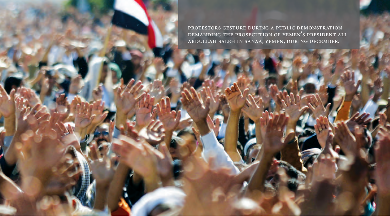
PROTESTORS GESTURE DURING A PUBLIC DEMONSTRATION DEMANDING THE PROSECUTION OF YEMEN'S PRESIDENT ALI ABDULLAH SALEH IN SANAA, YEMEN, DURING DECEMBER.

from our staff in many countries. [Yet they] rose to every occasion and refused to be intimidated.”