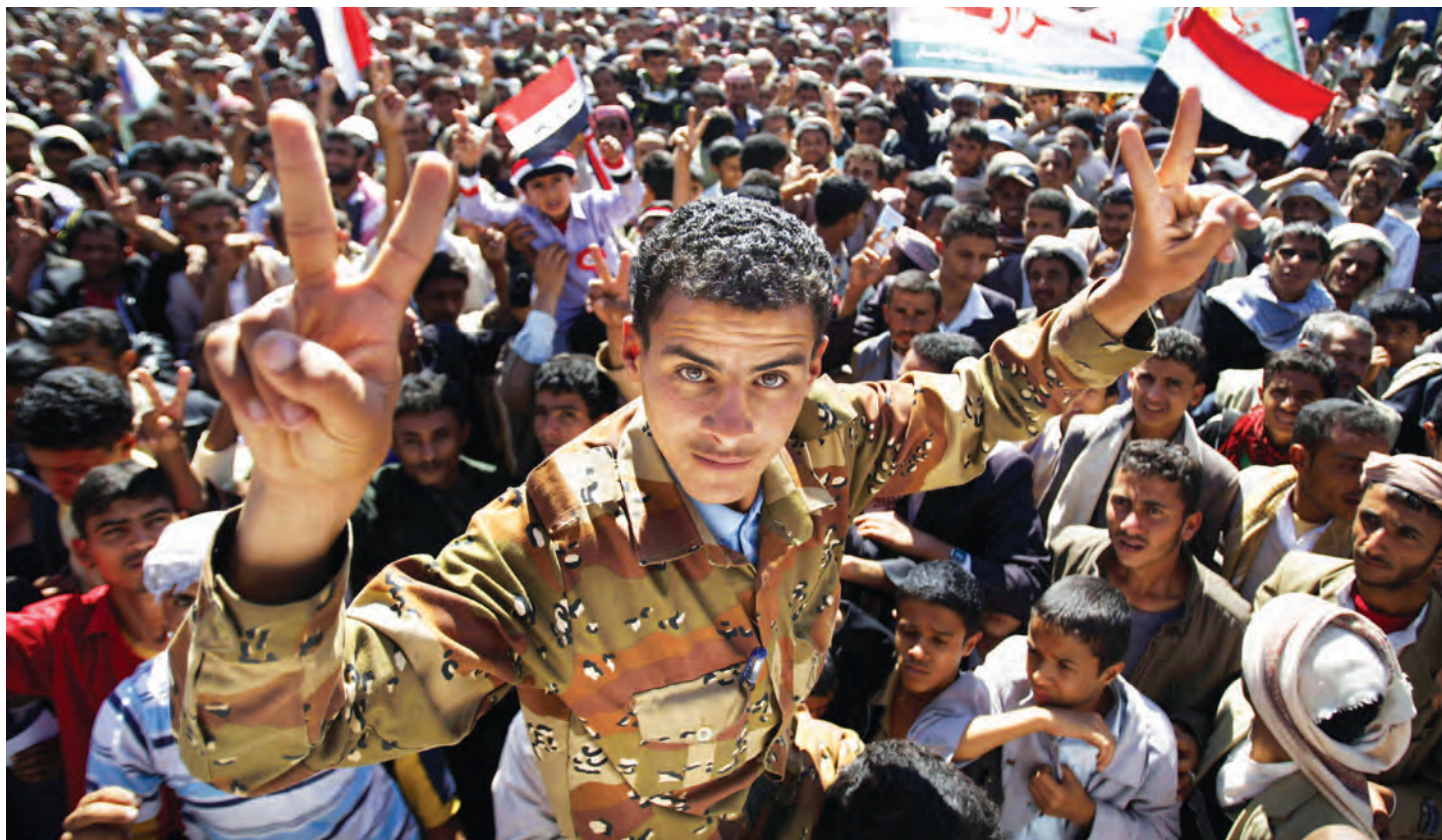
DURING A NOVEMBER MASS RALLY IN SANAA, YEMEN, FOLLOWING PRESIDENT ALI ABDULLAH SALEH’S AGREEMENT TO END HIS 33-YEAR CONTROL OVER THAT NATION’S GOVERNMENT, A SOLDIER WHO DEFECTED FROM YEMEN’S NATIONAL ARMY FLASHES A VICTORY SIGN.

U.S.-Syrian relations became contentious within the context of Arab Spring political turmoil elsewhere. Tensions erupted on July 11, when a large crowd gathered at the U.S. Embassy in Damascus and, within minutes, 50 protesters climbed the diplomatic compound’s perimeter walls. The mission’s Local Guard Force reacted dutifully, and all mission personnel were directed to safe havens in the compound as protesters smashed cameras, broke forced-entry ballistic-resistant windows, climbed on the roof, and attempted to set the post on fire. If not for the sound judgment of the DS RSO as Embassy employees remained secure inside the chancery,