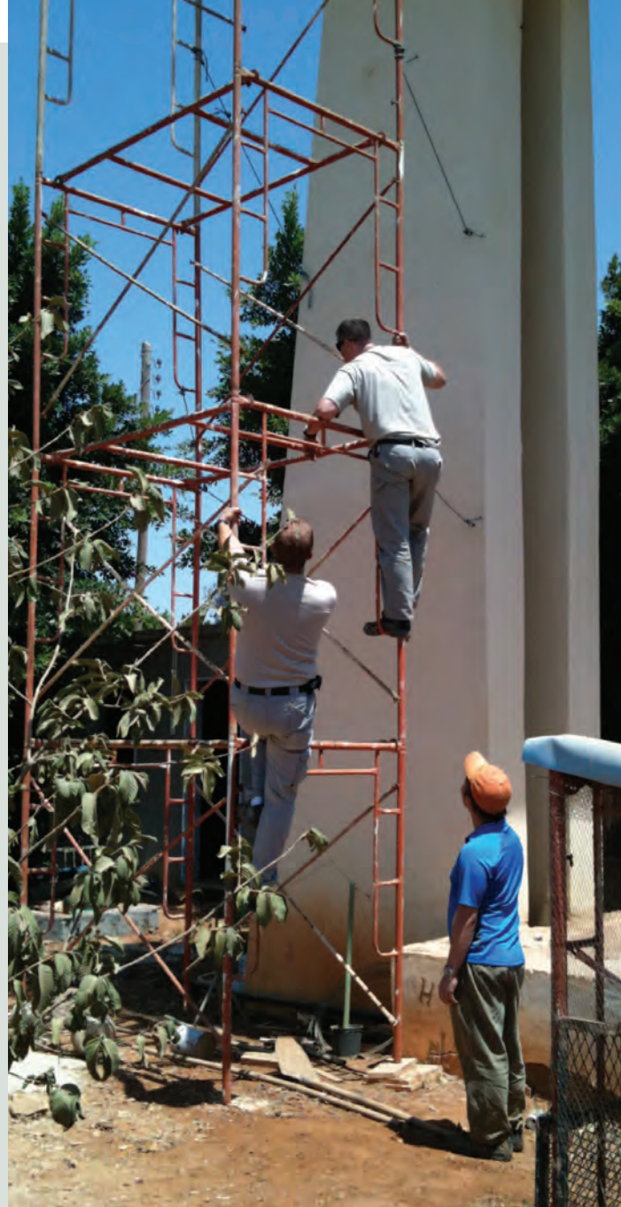
A DS SECURITY ENGINEERING OFFICER (ON SCAFFOLD AT LEFT) AND TWO DS SECURITY TECHNICAL SPECIALISTS (TOP OF SCAFFOLD AND ON GROUND) SURVEY AN INSTALLATION SITE FOR TECHNICAL SECURITY EQUIPMENT AT THE EXPEDITIONARY U.S. SPECIAL MISSION COMPOUND IN BENGHAZI, LIBYA, DURING AUGUST.

DS also has made major strides in adapting military technologies for peace-time use. For example, DS experts in technical security have realized significant advances in personnel-tracking, utilizing new inter-operable tracking technologies for use across multiple federal agencies and multiple satellite networks.