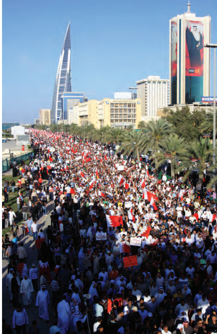
TENS OF THOUSANDS OF BAHRAINI ANTI-GOVERNMENT PROTESTERS MARCH IN THE CAPITAL OF MANAMA, BAHRAIN, PAST THE FINANCIAL DISTRICT TO THE PEARL ROUNDABOUT, WHERE THEY SET UP CAMP.

Shortly after Egyptian protesters took to Cairo's Tahrir Square, widespread demonstrations broke out in Manama on February 14. Over the next four weeks, Bahraini security forces engaged demonstrators, and armor was deployed on the streets of Manama. Widespread protests continued to rage for a month; and on March 13, U.S. Embassy Bahrain requested Authorized Departure status. In the rapidly unfolding circumstances, prompt and continuous reporting by the three RSO Manama special agents enabled the State Department to remain fully informed and make timely policy decisions.