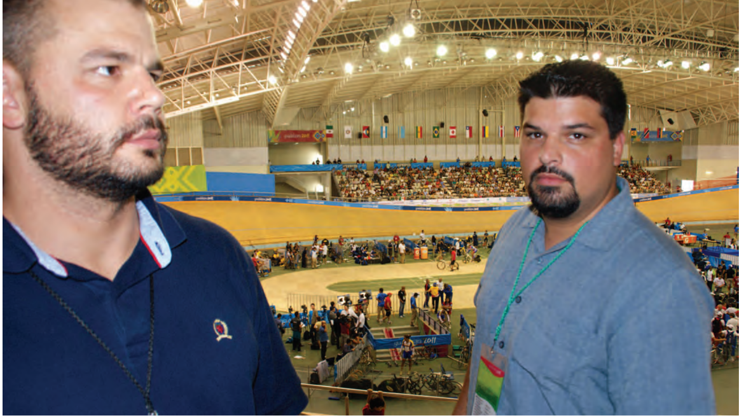
TWO SPECIAL AGENTS SERVE AS DS FIELD LIAISON OFFICERS AT THE PAN AMERICAN GAMES IN OCTOBER, PROVIDING SUPPORT INSIDE THE PAN AMERICAN VELODROME AT THE CODE PARADERO SPORTS COMPLEX IN GUADALAJARA, MEXICO.

...serving as field liaison officers and watch officers at 45 competition venues, within the athletes' village, in Mexican command centers, and in the U.S. inter-agency Joint Operations Center. In addition to being responsible for 600 U.S. athletes and 500 support staff, DS assisted with logistics for an official White House delegation, hundreds of U.S. media representatives, and thousands of American fans.