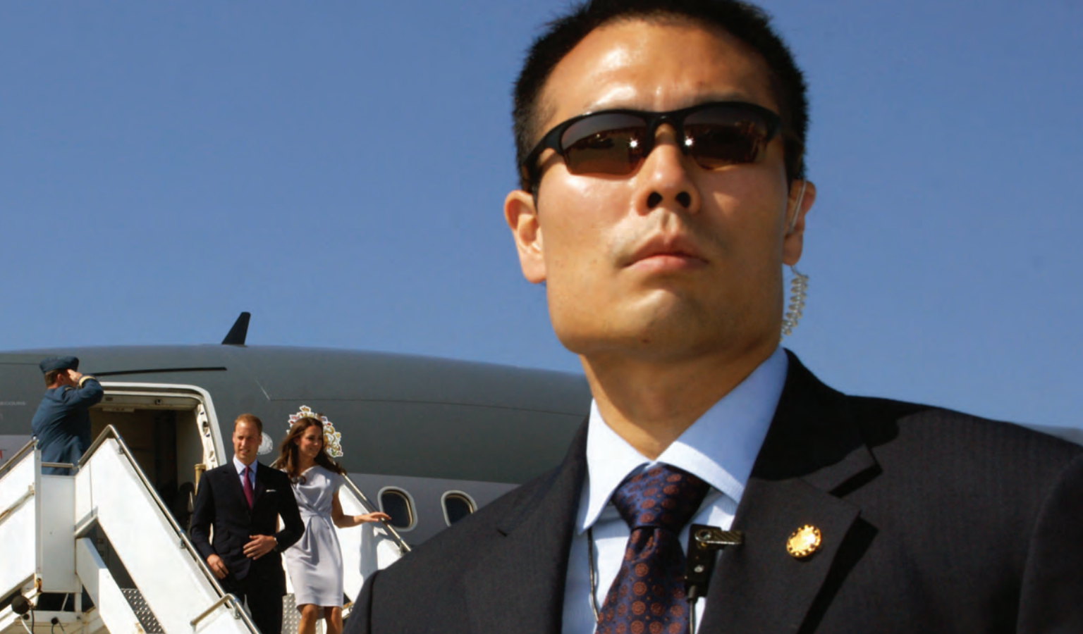
A DS SPECIAL AGENT SURVEYS THE CROWD AS GREAT BRITAIN'S DUKE AND DUCHESS OF CAMBRIDGE (REAR) ARRIVE AT LOS ANGELES INTERNATIONAL AIRPORT ON JULY 8.

Meanwhile, security for the annual United Nations General Assembly opening session in New York City – the largest DS protective detail assignment – began in mid-September, after months of planning and staffing. Nearly 530 Diplomatic Security agents – together with 120 agents from the U.S. Marshals Service and the U.S. Bureau of Alcohol, Tobacco, Firearms, and Explosives – participated in some 40 protective details during the two-week event. MSD deployed three teams to New York City in support of the United Nations event. In addition, close to 70 DS uniformed security officers assisted with protection, manning security posts at designated facilities around the city.