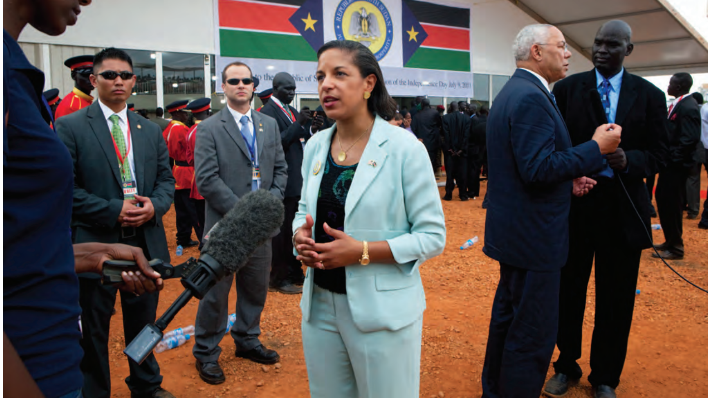
DS SPECIAL AGENTS (LEFT AND CENTER LEFT, WEARING SUNGLASSES) LOOK ON AS AMBASSADOR SUSAN E. RICE, UNITED STATES PERMANENT REPRESENTATIVE TO THE UNITED NATIONS (CENTER FOREGROUND), AND FORMER U.S. SECRETARY OF STATE COLIN POWELL (GESTURING AT RIGHT) SPEAK WITH REPORTERS AT THE REPUBLIC OF SOUTH SUDAN'S INDEPENDENCE DAY CELEBRATION IN JUBA ON JULY 9.

Following a historic popular referendum in January supporting South Sudan's independence, Diplomatic Security led efforts in support of U.S. foreign policy objectives by ensuring that security, safety, and resource concerns were met as the Juba Consulate was converted into the U.S. Embassy for South Sudan. In an extremely tense transitional climate with the potential for conflict in a number of regions, DS facilitated the successful deployment of U.S. government personnel throughout South Sudan.