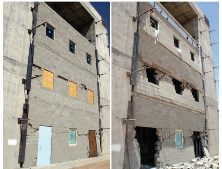
BEFORE (LEFT) AND AFTER (RIGHT) THE BLAST TEST IN A SIMULATED EMBASSY ATTACK

Other recent design advances in blast-resistant perimeter systems, as well as safe havens and bunkers, will prove beneficial to U.S. diplomatic missions in hostile environments.