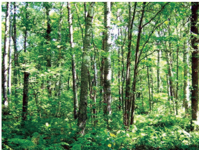
Characteristic Pike Bay forest dominated by trembling aspen and hardwoods.