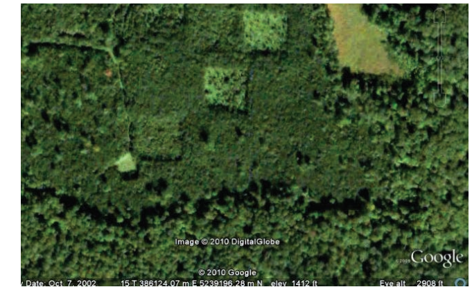
The Long-Term Soil Productivity (LTSP) installation at Pike Bay.

Plantations of trembling aspen, red pine, and white spruce established on the same soil type in the 1930s have provided important information on the role of species on soil development. Beginning in the 1940s, trembling aspen research began and has included thinning in young stands, prescribed burning, and effects of clearcutting on soil and stand productivity. Currently, the most active forest research is the Long-Term Soil Productivity (LTSP) Study. Pike Bay includes one of the three trembling aspen LTSP sites in the Lakes States. The study is in its 20 th year and is part of an international effort looking at the effects of biomass harvesting and soil compaction on long-term forest and soil productivity. Seasonal wetlands on Pike Bay have been studied extensively; this research has provided the first comprehensive examination of seasonal wetland structure and function in the Lake States.