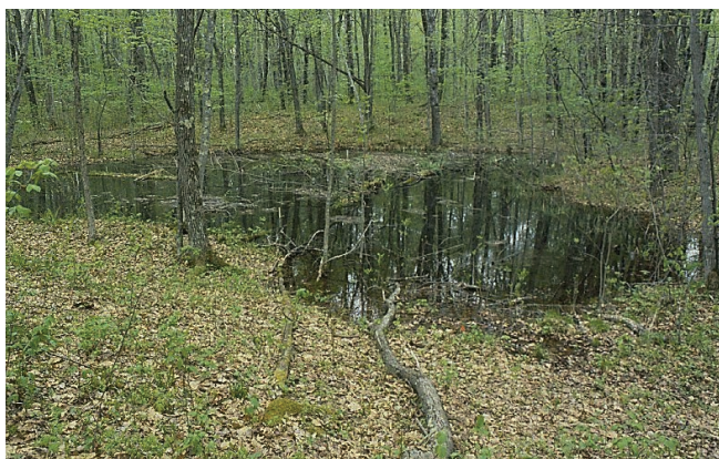
A seasonal woodland pond at Pike Bay.

Research collaborators include the Chippewa National Forest, the LTSP National Network, the University of Minnesota, the University of Georgia, and the Minnesota Department of Natural Resources.