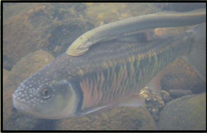
Striped shiner with Lamprey