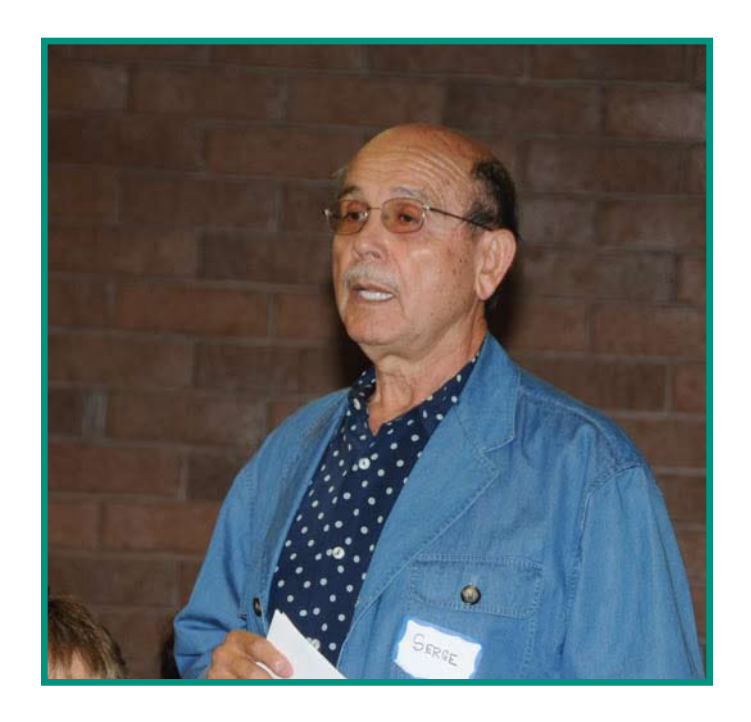
"Family members, friends and strangers all treat these people as if they chose this lifestyle, or as if they are crazy when in fact that is not the situation at all." — Lockport, NY

"Just as cancer was the big C word no one wanted to say, Alzheimer's disease must be talked about more to help us support each other better for a longer quality of life." — Clinton, IA