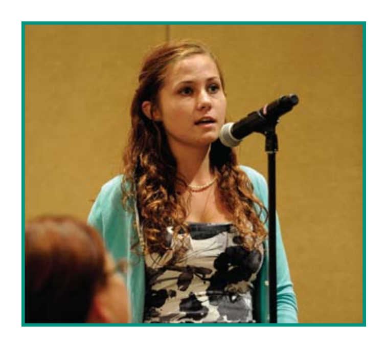
"One of my biggest frustrations is the cost of the Alzheimer's drugs. Alzheimer's is the MOST devastating of all diseases in my experience. And to be essentially punished by the exorbitant cost of the drugs to fight it is totally uncalled for." – Sallisaw, OK

"While we have always worked hard to provide our own insurance coverage, we were really in a bind last year when he 'hit the donut hole' in our coverage. Neither of us ever worked anywhere where there was a pension plan and we worked hard to look out for our own future by investing what we could. We hate now to see our meager savings dwindle because of the cost of medication." — Courtland, VA