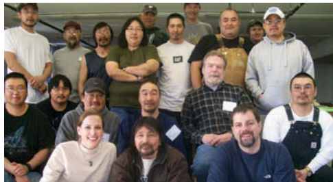
Nineteen students participated in the St. Mary's Rural Alaska Landfill Operators class.