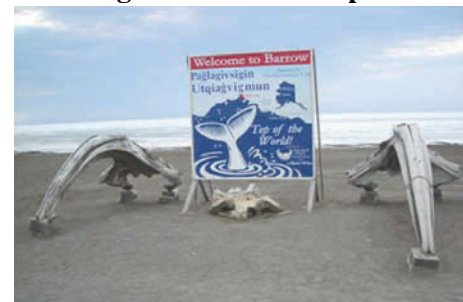
Whaling is critical to tribal members in Barrow, Alaska

In May 2009, over 25 tribal community members attended the stakeholder meetings on permits for oil and gas exploration on Outer Continental Shelf of Alaska's arctic region. Region 10 managers and staff traveled to Kotzebue and Barrow, Alaska, to conduct stakeholder meetings, a workshop, and an open house to discuss EPA's planned outreach activities for Outer Continental oil and gas exploration, air and water permitting, and hear native communities concerns about the proposed exploration and development. In September 2009, we returned to the North Slope hosting a series of public meetings, public hearings and consultations with Tribal governments.