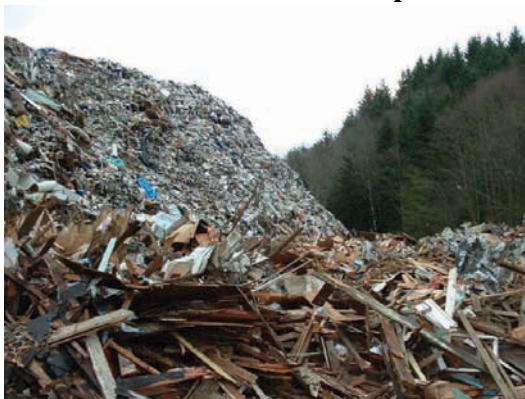
Multi-Agency efforts will help the Makah Tribe address the Warmhouse Beach Dump Site issues.