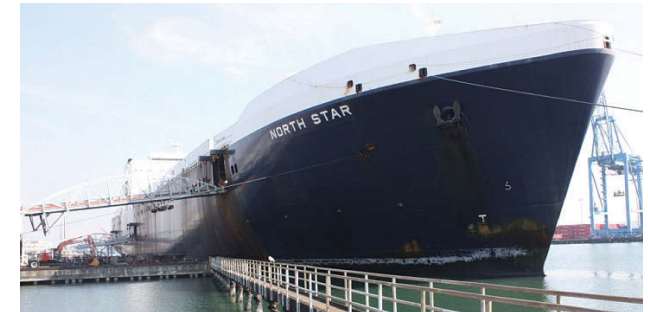
North Star retrofitted ship. Diesel retrofit projects will reduce PM emissions by 21 tons and NOx emissions by 14 tons.

In FY2009, the Region 10 Diesel Team together with the Region 9 Diesel Team and the West Coast Collaborative distributed just under $5.4 million dollars to eight projects across the two regions under the 2008 DERA competition. In Region 10, $1.85M in grant award funding was extended to the City of Portland, Idaho Dept. of Environmental Quality and the Puget