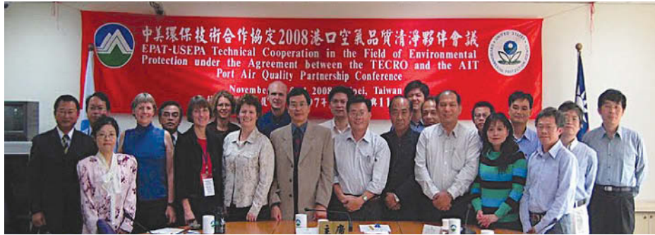
U.S. and Taiwan officials working together to improve ports air quality.

Taiwan EPA has announced plans to establish emissions inventories for port air pollutants, draft appropriate management policies for both mobile and stationary sources of port air pollutants, and develop domestic regulations in alignment with Annex 6 of MARPOL. This is a result of the fall 2008 U.S.-Taiwan Bilateral Environmental Cooperation Port Air Quality Partnership Conference co-sponsored by EPA Region 10. The EPA Region 10 Diesel Program supported this conference by staffing a delegation that included the U.S. EPA, Port of Seattle, Port of Tacoma and Puget Sound Clean Air Agency. The emissions inventory work is currently well underway, and a follow-up meeting is slated for November 2009 that will focus on management policies.