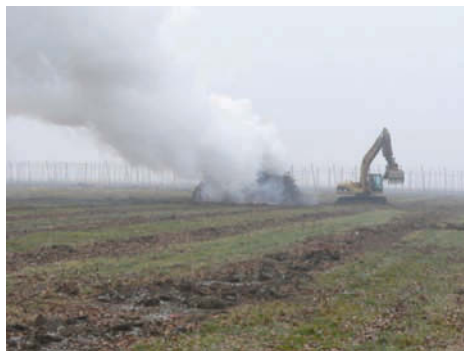
The FARR regulates agricultural burning of orchard debris.

Under the FARR, the Nez Perce Tribe issued burn permits for 45,611 agricultural acres, 775 piles and 285 acres of forestry burning, 118 large open burns, and 1,050 small open burns; and the Confederated Tribes of the Umatilla Indian Reservation issued over 100 open burning permits.