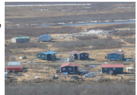
Updated data will allow EPA to track open dumps surrounding many Alaska tribal housing areas.

In 2009, EPA Regional Offices and the Indian Health Service worked together to complete a national inventory of open waste dumps in Indian Country. The update shows that the number of open dumps has climbed from 1200 in 1998 to above 3000 in 2009. The updated inventory presents highly credible and current information that will inform a variety of efforts and initiatives for closing open dumps. The inventory includes 578 dumps in Region 10, 69 of which are ranked as high health threats. This is an outcome of our effort working with the Indian Program Policy Council and other Regional offices to get new national Government Performance Results Act (GPRA) measures adopted which includes the closure, clean-up and upgrade of open dumps in Indian Country.