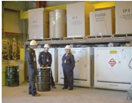
The BPXA Prudhoe Bay facility was first to receive a RCRA standardized permit.

In Fiscal Year 2009, the RCRA Corrective Action and Permits team requested public review and comment on the Draft Standardized Hazardous Waste Storage Permit (Permit) for the BP Exploration (Alaska), Inc. (BPXA) Prudhoe Bay facility. The Permit is the first RCRA standardized permit to be issued in the nation allowing a more efficient and streamlined process for future RCRA permits. The Permit includes requirements for the clean up of hazardous waste releases, and incorporates by reference BPXA's RCRA Administrative Order on Consent, dated October 3, 2007 as the corrective action requirements, allowing BPXA to generate and store wastes related to oil and gas production,