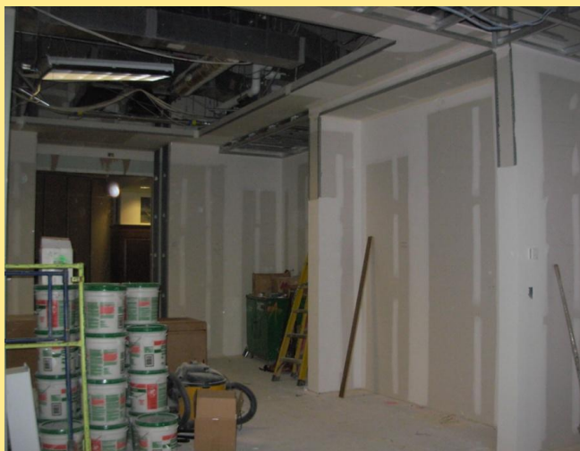
Consultation room looking back to the original door opening and a finding aids bookcase alcove.

The work to construct the wall on the south side of the existing Microfilm Research Room is currently scheduled to take place during the week of February 20, 2012, rather than within the month of January as mentioned in the previous update. Work taking place in the southwest corner of the Research Center continues. Here are pictures taken on January 9 of the Consultation / Finding Aids room and the new Classroom. Ceiling installation began the week of January 16. We're on track to open the Consultation / Finding Aids room around February 22 or so.