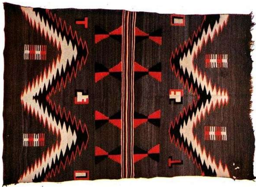
A PTT Grant was awarded to the University of Arizona to analyze contaminated Navajo textiles.

Field: University of Texas at Austin researchers will develop and optimize a web tool to survey historic resources in the field. ($25,000)