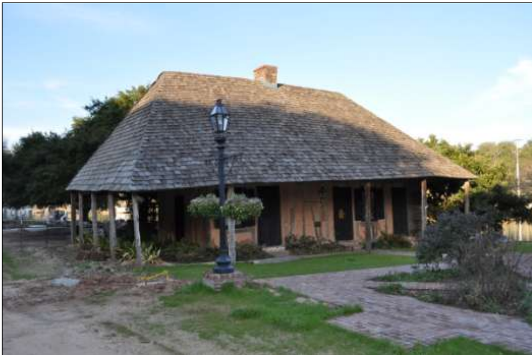
NCPTT staff consulted on repairs to the historic Roque House, Natchitoches, LA.

NCPTT staff were called in to inspect another local icon, Roque House. The bousillage building, owned by the Natchitoches Historic Foundation, was originally constructed by a freed slave in 1803 on a farmstead twenty-two miles south of its present location in the City of Natchitoches. Staff assessed serious structural issues with the building and produced a report of their findings. With NCPTT's expert guidance, the Foundation was able to make appropriate repairs and avert risks to public health and safety.