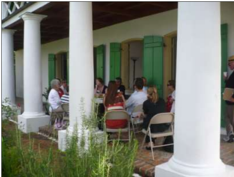
Participants discuss workshop on the porch of Pitot House, New Orleans, LA.

Recognizing that the future of the preservation profession is seeded in the next generation of practitioners, NCPTT is working with universities to enhance the state of pre-professional training in the field. In FY2011, the National Center hosted and funded the initial meeting of the Southeastern College Art Conference (SECAC) Consortium for Historic Preservation and Conservation Studies. SECAC is an academic consortium consisting of twelve universities located across the southeastern United States. Members of the consortium met with NCPTT staff to discuss development of a preservation curriculum that would supplement courses at SECAC architecture schools. The goal of this project is to create an intercollegiate program that provides students with a state-of-the-art education in preservation theory, technology, and design—drawing experience from the faculty of each of school as well as professionals in government and private practice.