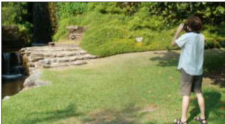
Derek Linn documents the landscape at Hodges Gardens State Park, Florien, LA.

Compiling thorough documentation is the first step in protecting historic landscapes. While a number of publications focus on nominating landscapes for historic registers or creating detailed cultural landscape reports, these do not contain the “nuts and bolts” information needed to research and document sites. NCPTT is working to fill this gap by providing a “how to” guide for documenting historic landscapes.