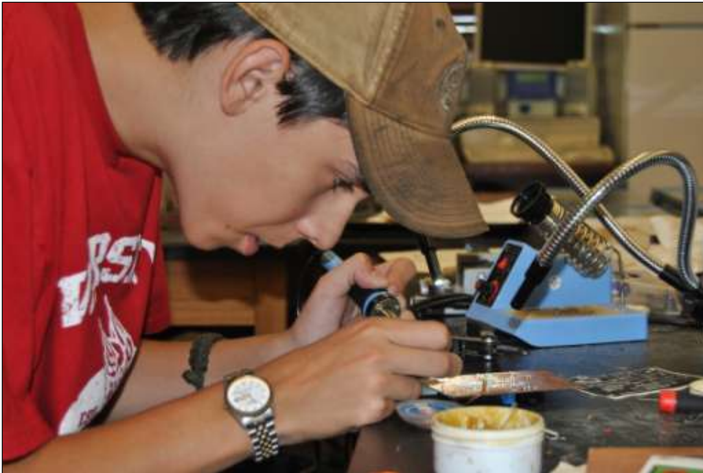
A participant solders a circuit board during a robotics camp held at Lee H. Nelson Hall, Natchitoches, LA.