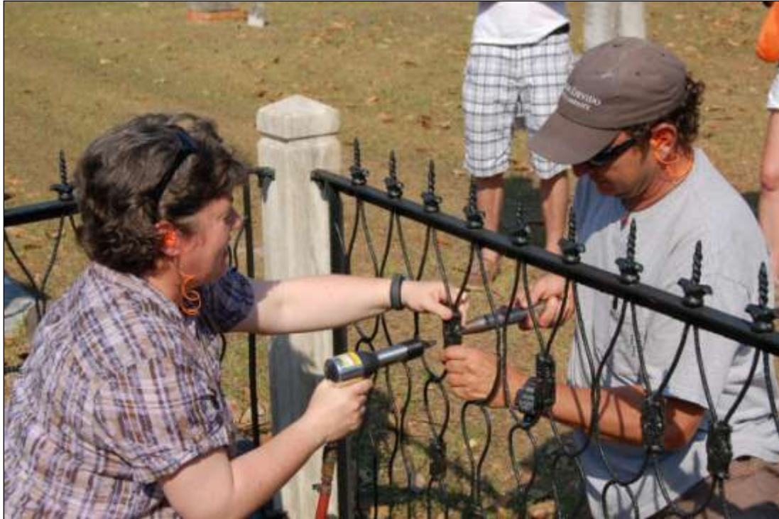
Ornamental Iron Workshop participants practice riveting techniques in Savannah, GA.

Drawing from NCPIT's study of rust converters and other conservation research, the National Center offered a two-day training workshop on the conservation of ornamental iron, May 18–19, 2011, in Savannah, Georgia. The event attracted fifteen students, contractors, government employees, and maintenance managers. Participants were exposed to a wide range of skills, from documentation and cleaning to rust conversion and painting. A similar course will be held October 7–8, 2011, in Bloomington, Indiana.