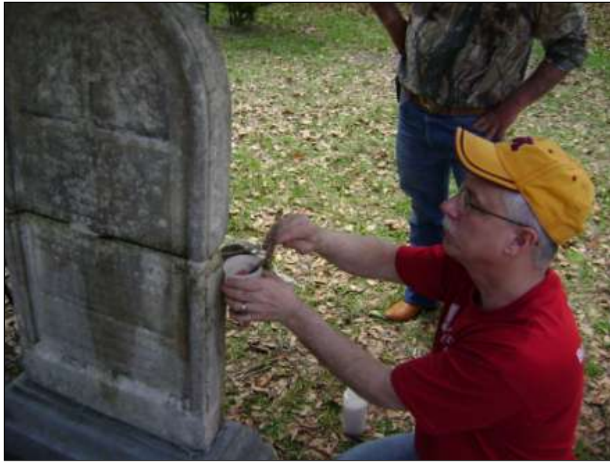
A participant repairs a grave marker during a workshop held in St. Augustine, FL.

Preservation and Treatment of Park Cultural Resources, Sept. 19–23, 2011, Natchitoches, LA: Sponsored by the Stephen T. Mather Training Center in collaboration with NCPTT and Cane River Creole National Historical Park. Training included aspects of park cultural landscape preservation and treatment.