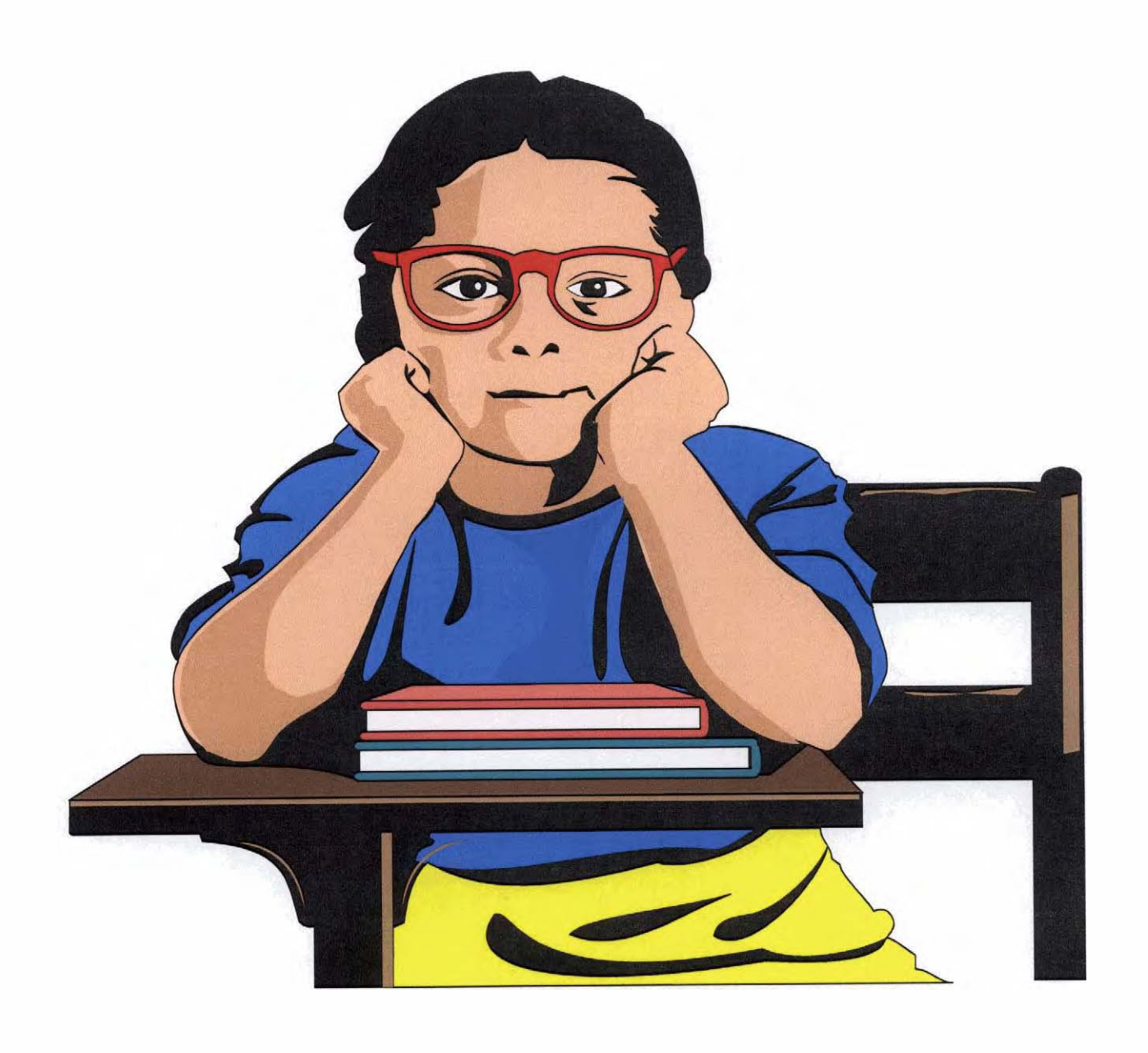
Department of Defense Education Activity Material Management Manual