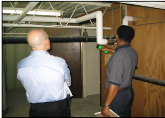
Health department and state regulatory agency staff tour the building looking for health and safety hazards.