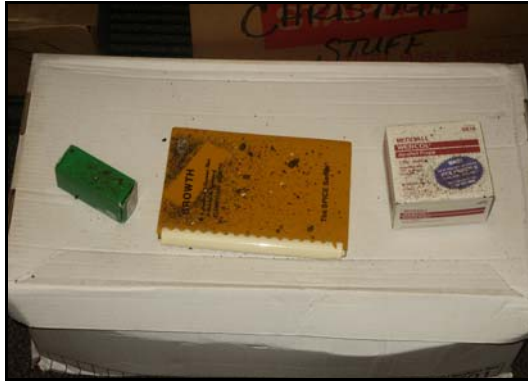
Debris from roof improvements falls on workspaces.