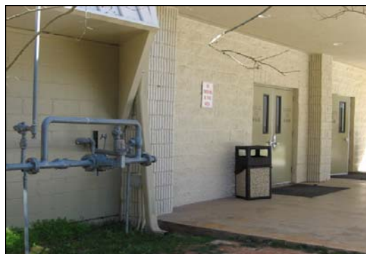
Pressurized gas lines exposed near the front entrance of the health department.