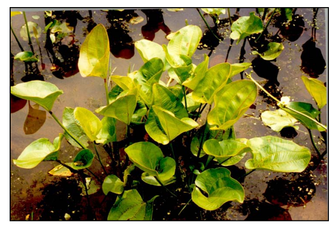
Figure 1 Creeping burhead