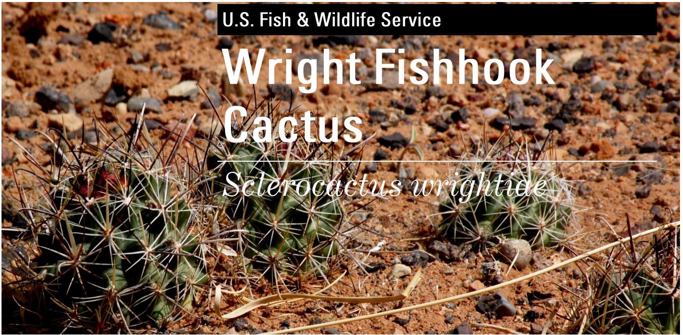
Wright fishhook cactus