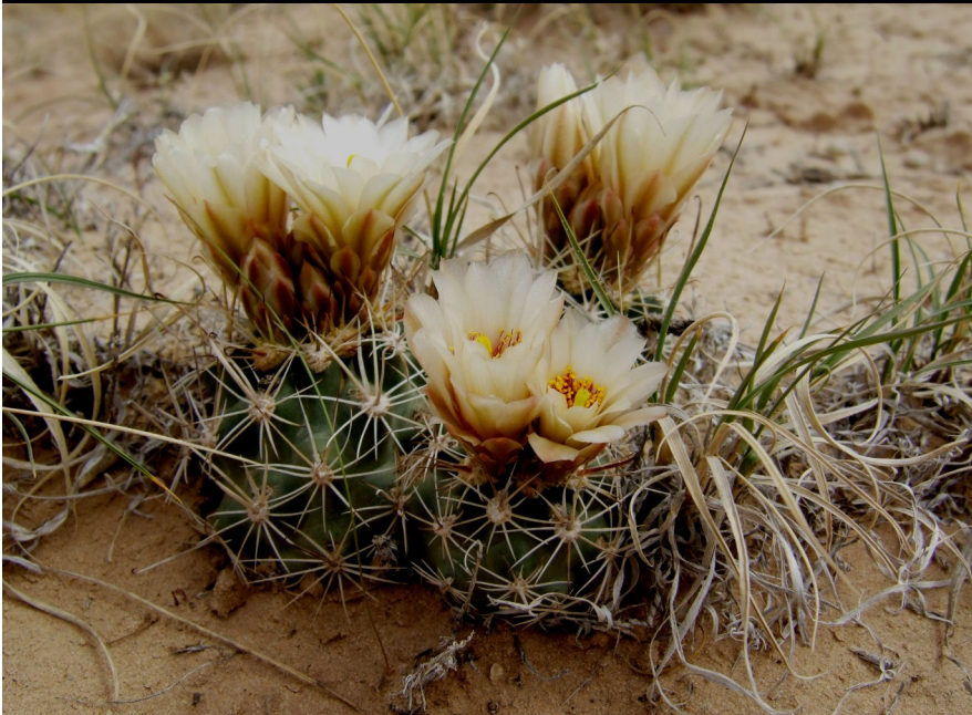
Wright fishhook cactus in flower / Dorde Woodruff

collection, and small population sizes. Recreational use, including off highway vehicles, grazing, high mortality to recruitment ratios, predation, and drought related impacts are the largest threats this species faces today. In addition, the Wright fishhook cactus is highly sought by cactus collectors, making illegal collection a concern.