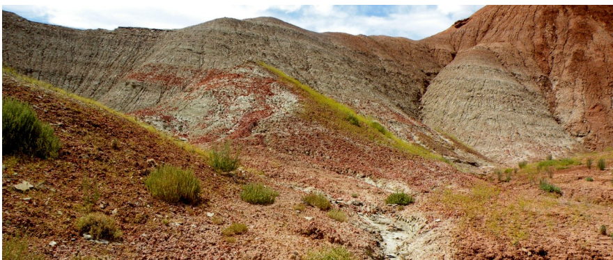
Wright fishhook cactus habitat