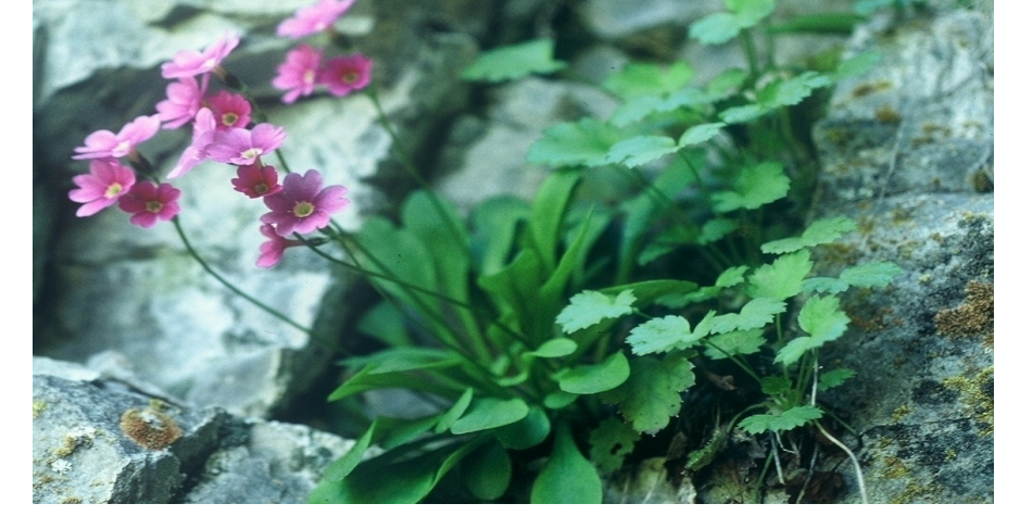
Maguire primrose