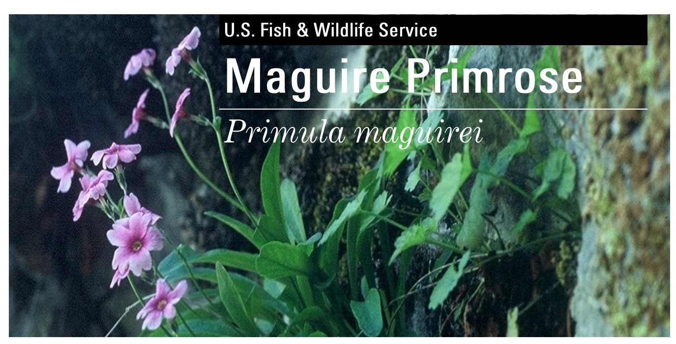
Maguire primrose / USFWS