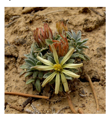
Close-up view

In August 1993, we published a recovery plan that lists necessary actions to recover the species. We are working with our Federal, State, and private partners to implement these recovery efforts. We worked with Federal land management agencies to reduce impacts from coal mining and exploration, off-road vehicle usage, and grazing. We worked with State and local governments to reduce impacts from road projects. We surveyed much of the species' habitat and located