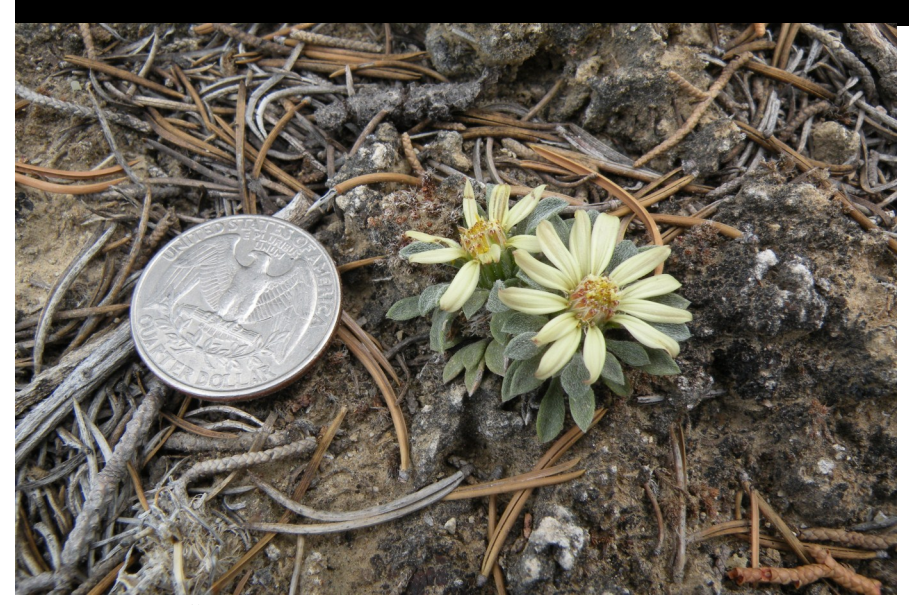
Last Chance townsendia compared to a quarter