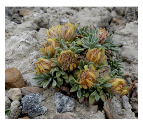
Last Chance townsendia in habitat

The Last Chance townsendia (Townsendia aprica) is a low-growing perennial herb in the sunflower family. The species is stemless, with its leaves and flowers around ground level. It measures less than one inch tall and 1 - 2 inches wide. Last Chance townsendia has narrow leaves measuring about 0.5 inches long which are covered with fine hairs. The flower is apricot to yelloworange in color with a darker colored center than the outer petals. Flowering occurs from April to May while fruiting occurs from May to June.