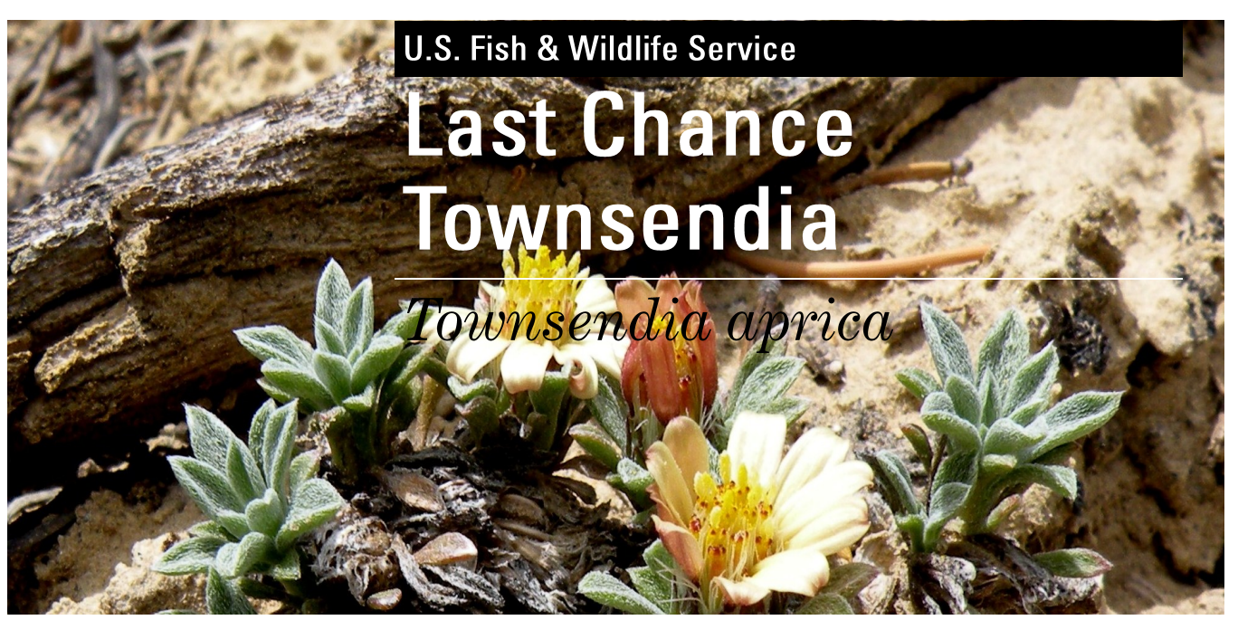
Last Chance townsendia / usfws