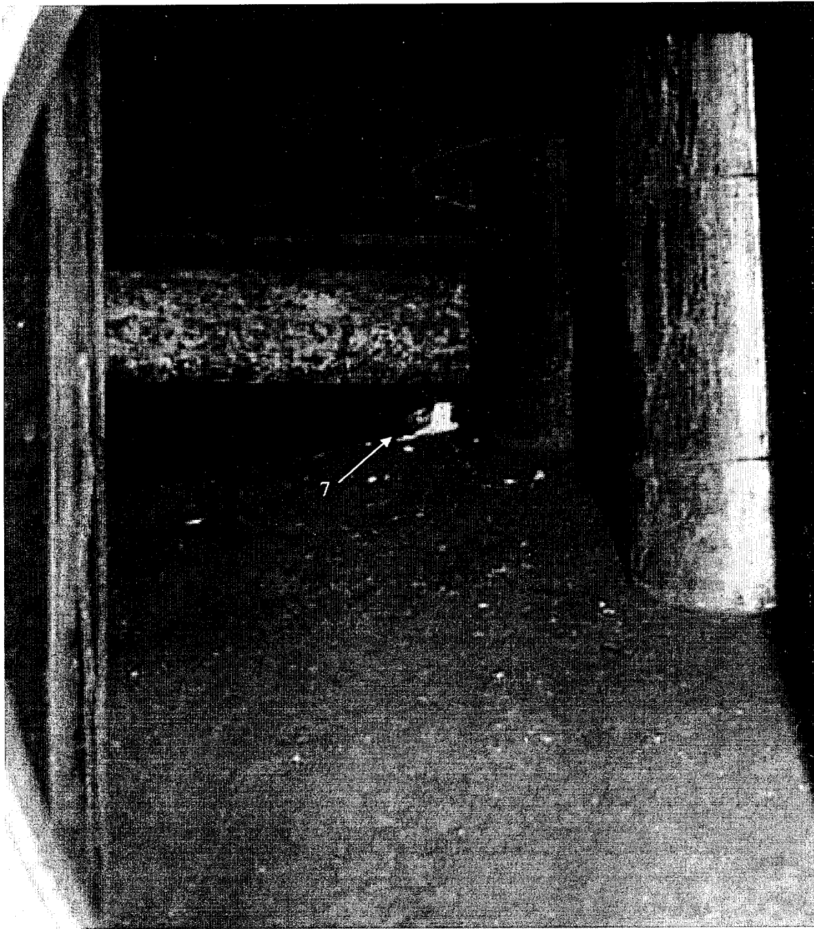
Figure 1 Oconee Unit 1 CRDM Nozzle 7, Top of RV head inspection for Boric acid crystals, 03/31/02