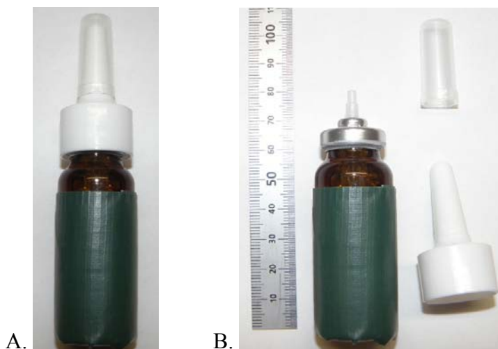
Figure 2. Glass bottle with a metal-housed, crimped-on, metered-dose pump; detachable nozzle; and overcap (A) assembled and (B) disassembled.