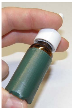
Figure 3. Assembled metered-dose pump package ready for use.