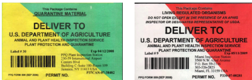
FIGURE 1: Green and Yellow and Red and White Mailing Labels