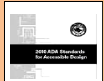
2010 ADA Standards became Mandatory March 15, 2012