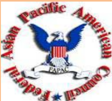
The Federal Asian Pacific American Council (FAPAC)