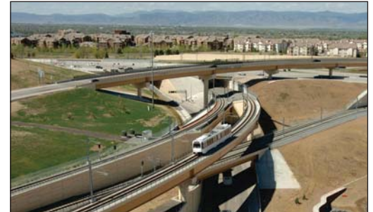
The T-Rex Project was delivered rapidly, thanks in part to early approval of funding.

Although the assignment of Federal-aid funding categories is rarely a topic of public discussion, addressing the resource constraints that confront major projects requires significant public scrutiny of revenue,