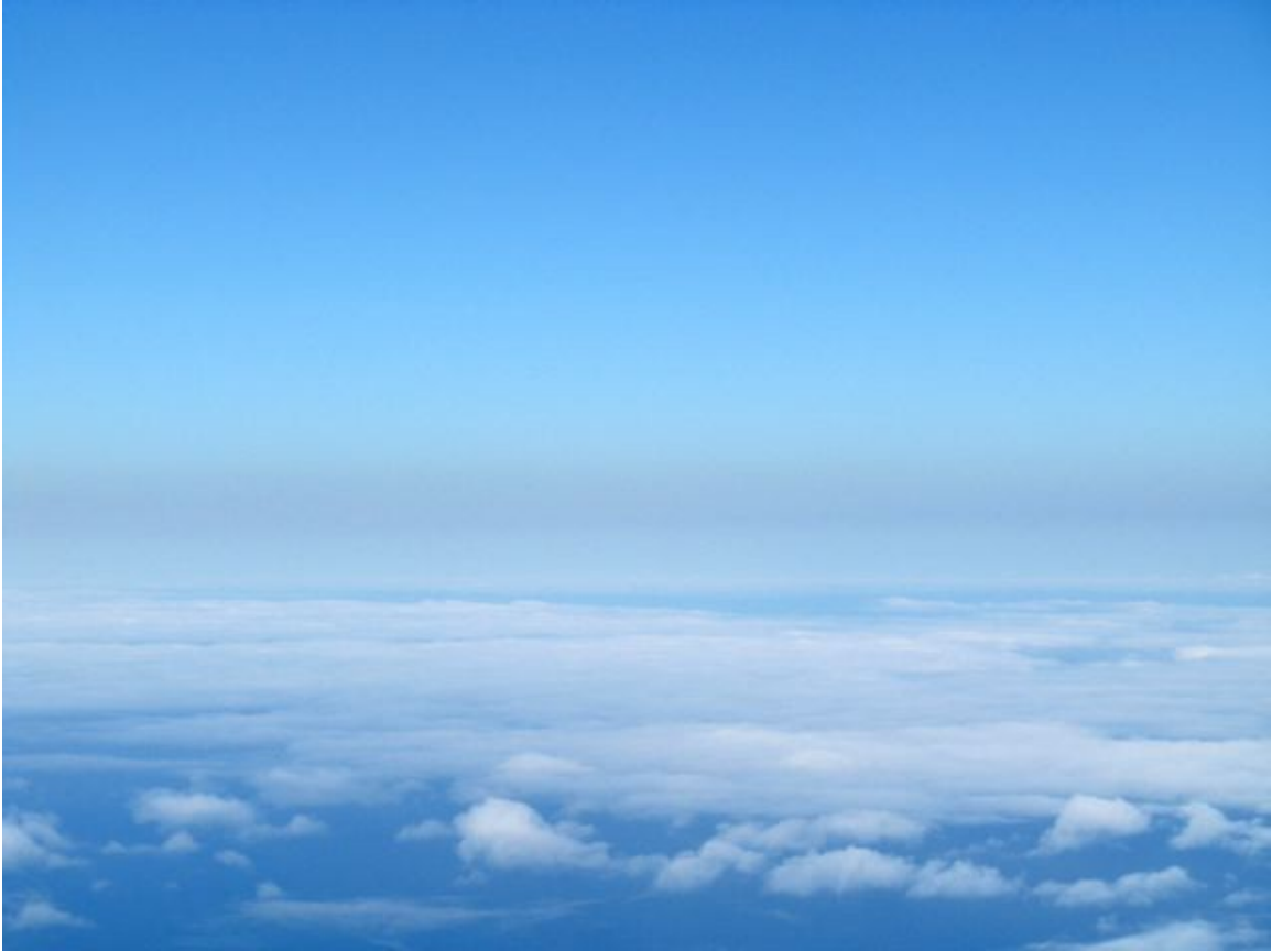
Aerosol layer (~8000 ft) observed near the Galapagos 15:02 GMT