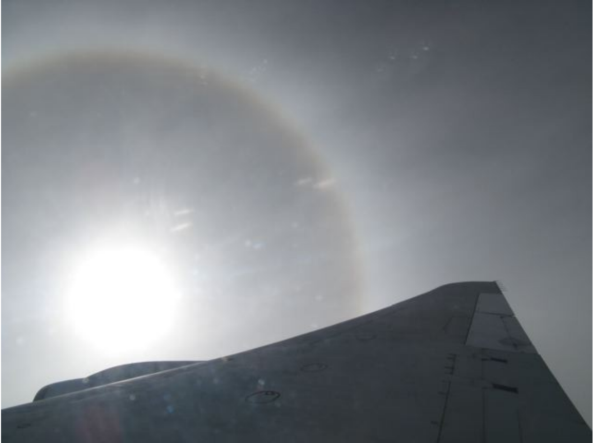
Halo observed as we were flying through cirrus on the way to Galapagos 12:52 GMT