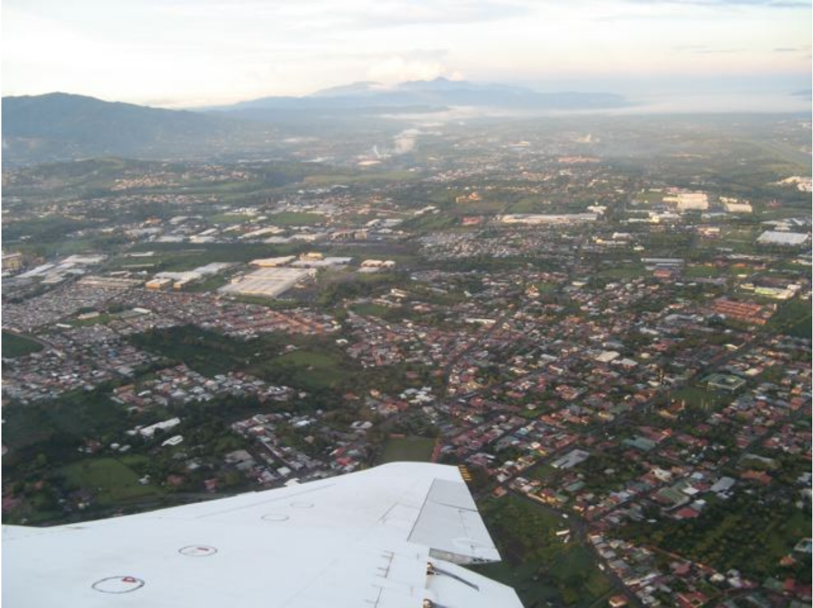
View of San Jose at climb out