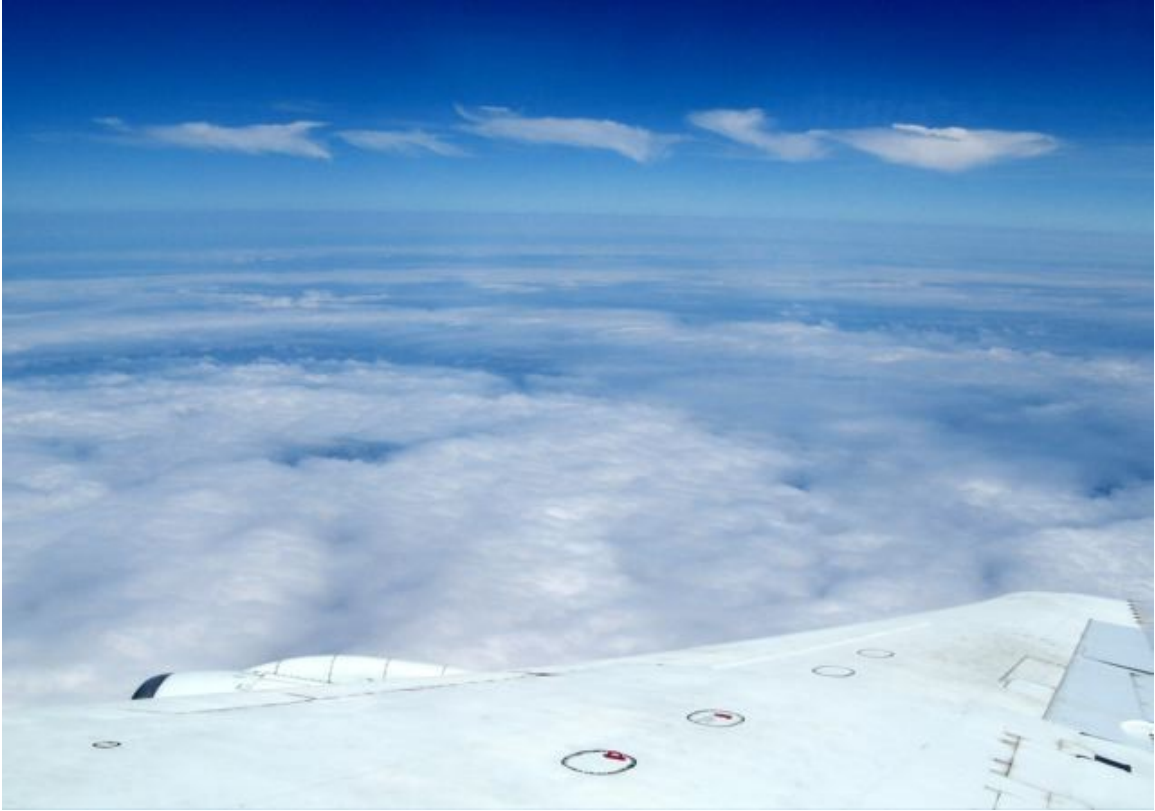
Karman vortex produced in the lee of the Galapagos observed as we are spiraling up. Note cirrus train over the islands 16:41 GMT