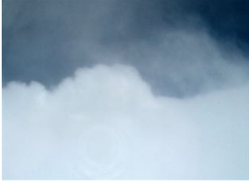
Turret punching upward off RHS of aircraft as we crossed convective systems along the Cloudsat track (18:33GMT)