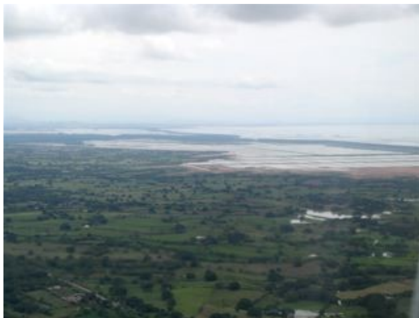
Panama landscape during boundary layer run near the Native Trailer (17:36 GMT)