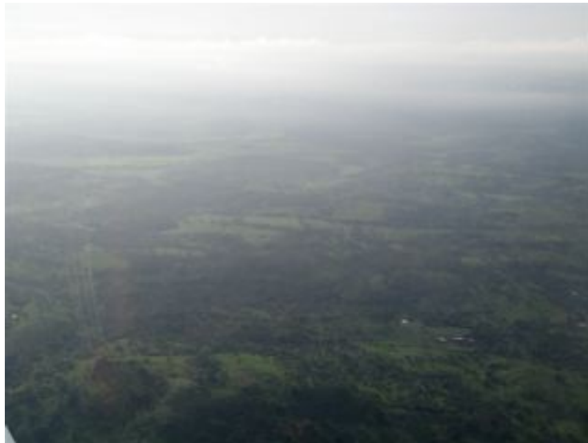
Nicaraguan land we were flying over at 1000 ft (Photo at 13:17 AM GMT).