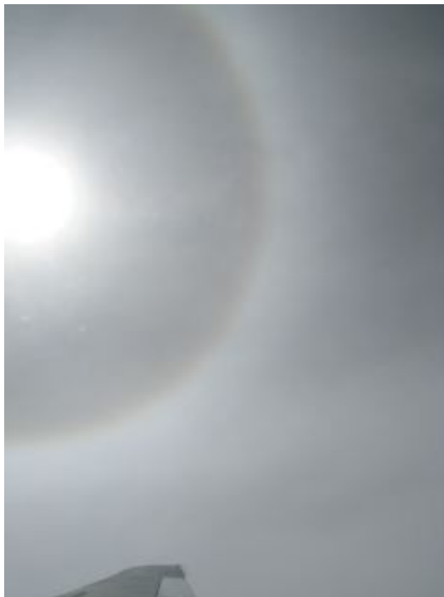
Haloe around sun in thin cirrus on route with 57 back to SJ (15.04 GMT).