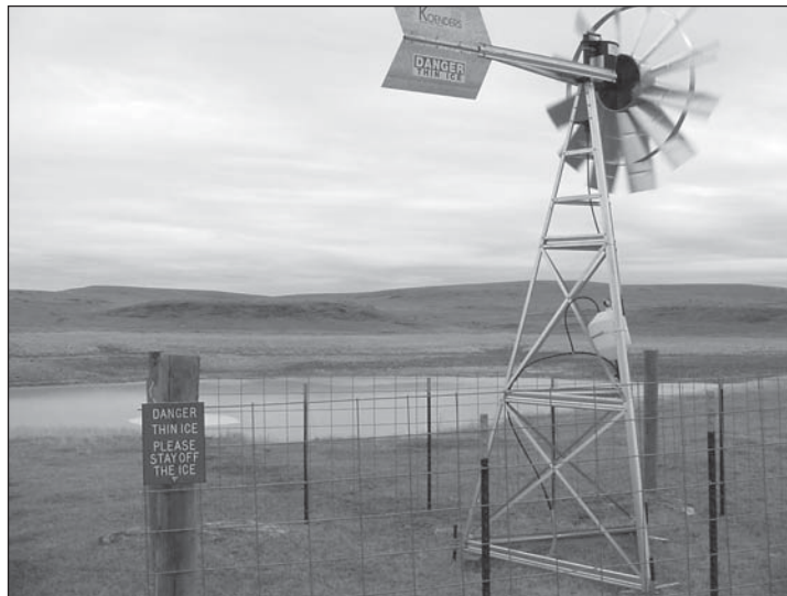
WINDPOWER FOR FISH —The wind-generated aeration system needs only a 5 mph breeze in order to keep five-acre feet of water oxygenated. A by-product of aeration is thin ice. Individuals are encouraged to avoid an unpleasant soaking by staying on dry ground during the winter months.

That is where the windmills come into play. According to the manufacturer, Koenders Windmills Inc. from Saskatchewan, the 12-foot tower supports a 12-blade turbine which harnesses winds as low as 5 mph. The crankshaft provides a ½ inch stroke on a 9-inch diaphragm, producing 1.5 cubic-feet of air per minute at 5 pounds per square inch.