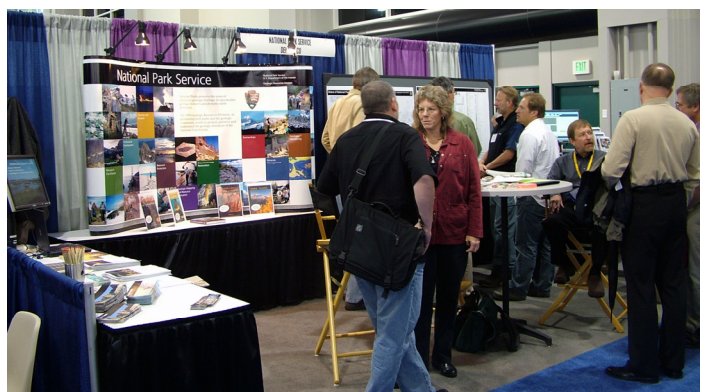
GRD staff discuss NPS geologic resources with attendees of the Geological Society of America's (GSA) Annual Meeting in Salt Lake City, Utah

The Division continues to promote "Conservation through Cooperation, Consultation and Communication" with undertakings designed to increase public awareness of the unique geologic resources in parks and to engage the professional geology community and earth science educators in using parks for teaching and research. The NPS geology website is an important component of the public outreach effort. The Division maintained site highlights geologic program areas and has content ranging from visitor geology tours to scientific knowledge of park and regional geology. The website has numerous useful links to geologic community websites, such as the National Science Foundation's Digital