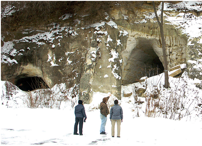
Site assessment of abandoned mine hazards at Mississippi National River and Recreational Area, Minnesota

proposals from parks and selected 188 projects for submittal to the Department. Proposed contributions from 339 partners in these projects were almost $11 million. However, Congress did not provide funds to the NPS for the CCI program in FY 2005.