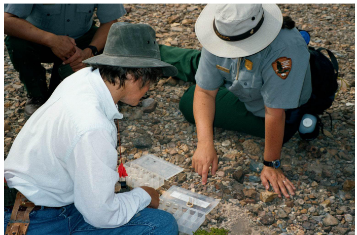
Performing Soil Aggregate Stability test at Big Bend National Park, Texas

Through the partnership with the NRCS, the SRI projects help parks secure the information needed to manage soil sustainability and to protect water quality, wetlands, vegetation communities, and wildlife habitats. The information also assists control exotic species and establishment of native communities, as well as more management of potentially high-