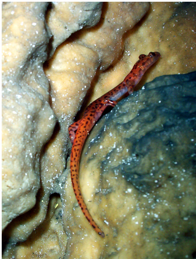
A Cave Salamander ( Eurycea lucifuga ) near the exit gate in Cudjo Cave, Cumberland Gap National Historic Park, Kentucky

In 2005, the Division's cave and karst resource management staff provided technical assistance and support to cave