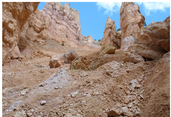
Rockfall hazards above Wall Street on Navajo Loop Trail, Bryce Canyon National Park, Utah

In 2005, Division staff provided technical expertise in the assessment and evaluation of geohazards in numerous parks, in response to park requests. The control of naturally occurring geologic processes are challenging and generally expensive, often futile, and can have harmful impacts that can outweigh their benefits if not well planned. To reduce the hazard, the staff provided assistance by acquiring scientific information about the nature of a park’s geologic hazards and the degree of risk they represent, then incorporating that information into the planning process and providing recommendations for park management decisions to help minimize the exposure of people and facilities to hazards. Examples of technical support for the