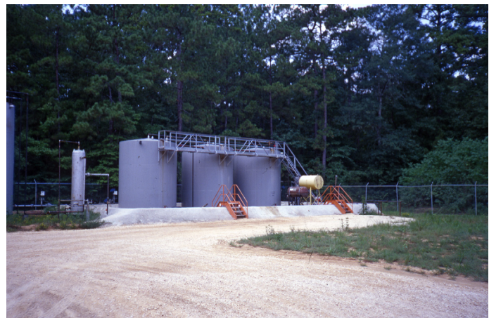
Clean and well maintained production operation in Big Thicket National Preserve, Texas. Note that the production area is fenced and free of debris.