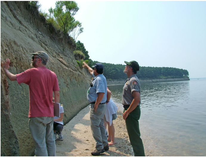
During GRE scoping at George Washington Birthplace National Monument, Virginia, NPS and USGS geologists examine wave cut erosion caused by Hurricane Isabelle.

Since the advent of the program, new mapping projects by these partners have been initiated in over 45 parks. GRE support has become a critical selection factor for USGS, state, and academic geologists proposing mapping projects funded by the USGS National Cooperative Geologic Mapping Program (NCGMP); so critical, in fact, that in 2005 the NCGMP identified collaborative work with the NPS as one of their OMB PART goals. Later in the year, the two agencies agreed to share map databases, which will provide enhanced access for the GRE to the USGS map database and direct access to GRE generated maps for the USGS site.