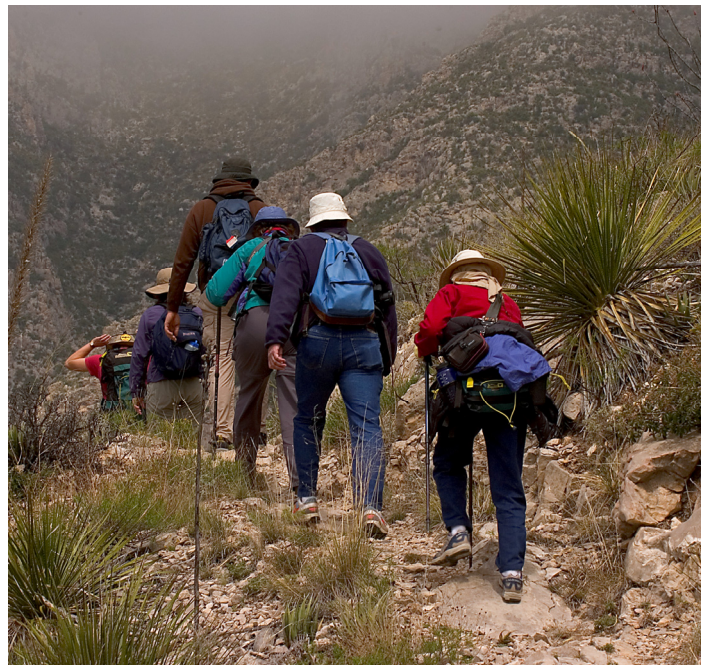
Members of the Association of Women Geoscientists accompany NPS staff on the Permian reef trail in Guadalupe Mountains National Park, Texas

Staff continued efforts in 2005 to facilitate geoscience research by working with the scientific community to meet parks' research needs. They connected Geoscientist specialists with park staff to help examine research proposals and conduct peer reviews, and to identify significant research needs that would facilitate understanding and management of the park resources. The division continued to work with EarthScope project staff to facilitate the placement of research equipment in national parks and providing outreach to the public. EarthScope, the largest earth science project ever funded by the National Science Foundation, is examining how plate tectonics continue to shape our country. Staff also worked on with Memphis State using a new 3-D laser scanning technology to investigate effects of rock climbing on lichen species on rock outcrops at Shenandoah National Park. Initial study results are promising and the technology may have additional applications for park resource management.