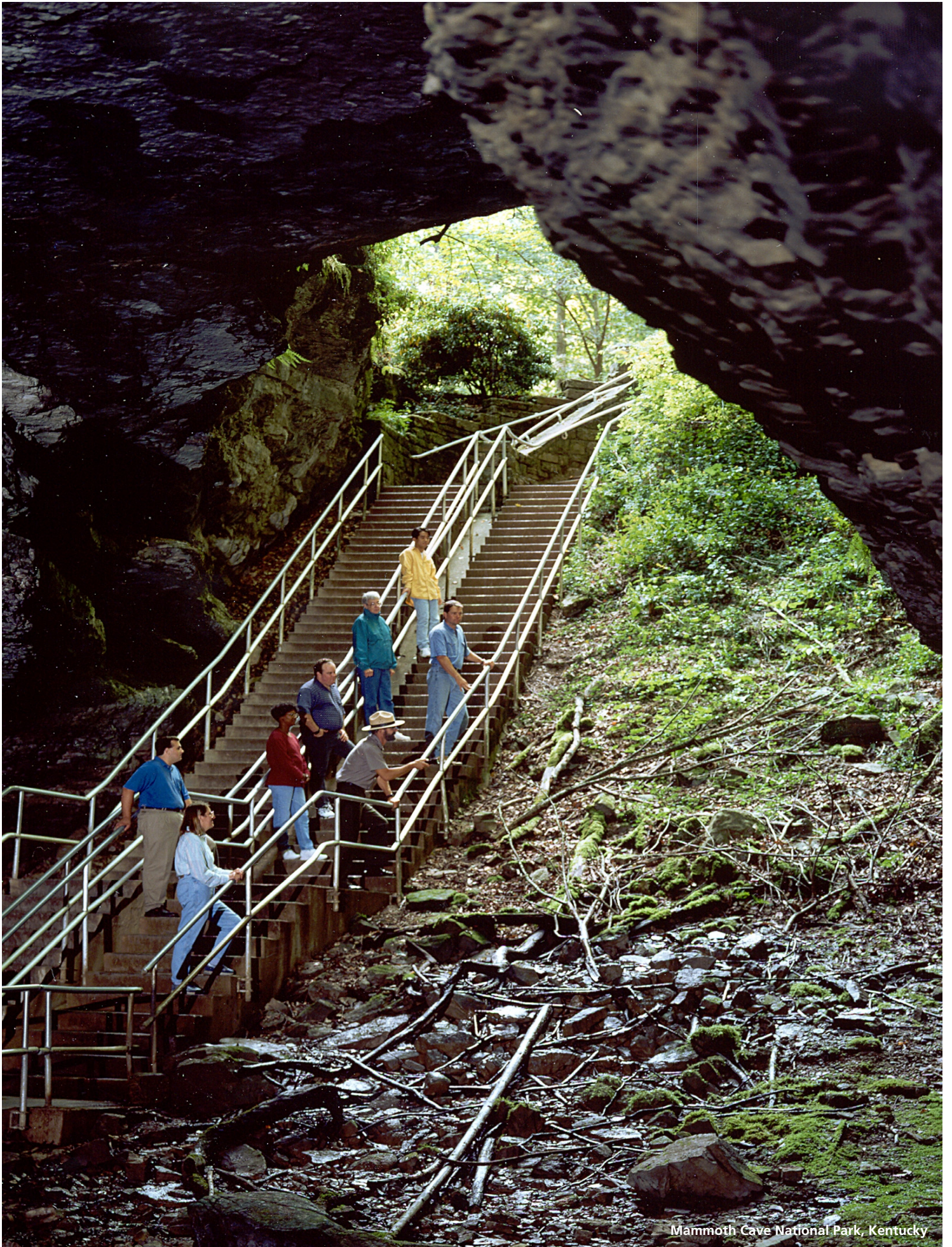
Mammoth Cave National Park, Kentucky