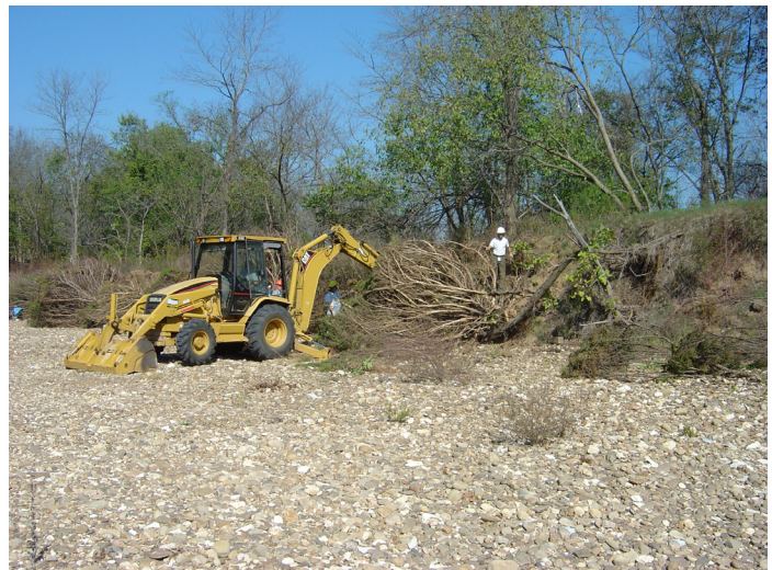
Construction of cedar revetment for bank stabilization at Cash Bend, Buffalo National River, Arkansas, one of ongoing FY05 NRPP disturbed lands funded projects.

Division staff also coordinated the NPS Cooperative Conservation Initiative (CCI) solicitation and worked closely with Department officials on the project approval and follow-up process for park submitted projects in FY 2004. For FY 2005, as requested by Department officials, staff solicited CCI