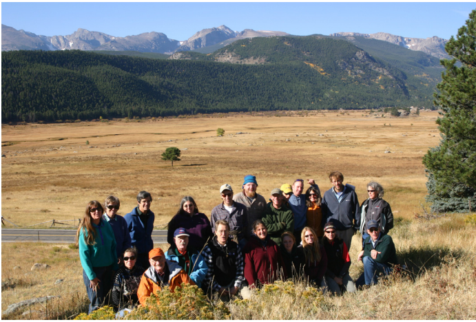
Park staff attendees of Oregon State University's interpretive training program in Rocky Mountain National Park, Colorado

Earth Science Library and EarthScope pages, and U.S. Geological Survey and state geological surveys sites. The NPS geology website is dynamic, has very high visitation, and receives frequent inquiries and positive reviews from the public.