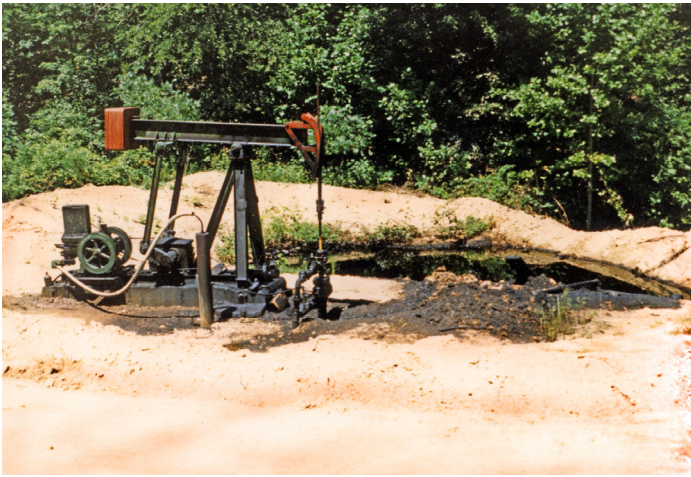
Poorly maintained production site at Big South Fork National River and Recreation Area, Tennessee. Note the contaminated soils adjacent to the pumpjack and the secondary containment pit downslope from the site.

legislative change to the Gulf Island Enabling Statute that would enhance of the development of state oil and gas rights, and a prospective operator's interest in developing oil and gas immediately adjacent to the boundary of Theodore Roosevelt National Park.