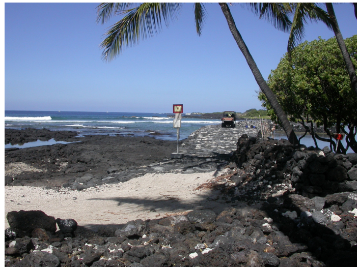
Park staff repair the storm-damaged Kaloko fishpond wall at Kaloko-Honokohau National Historic Park, Hawaii

Coastal geology staff initiated a Natural Resource Program Center “coastal team,” with quarterly conference calls, to enhance communication and consistency across the Center’s divisions and improve assistance to parks, regions, and the NPS Directorate. The staff also helped identify coastal issues for many Alaska parks and coordinated several coastal and marine mapping topics for the NPS Ocean Parks Task Force. Other specific accomplishments include debut of a teaching module for the web- based education center, supervision of coastal Geoscientist- in- the- Parks projects and research conducted by graduate and undergraduate students, oversight of the NRPP- funded boat wake study at Boston Harbor Islands National