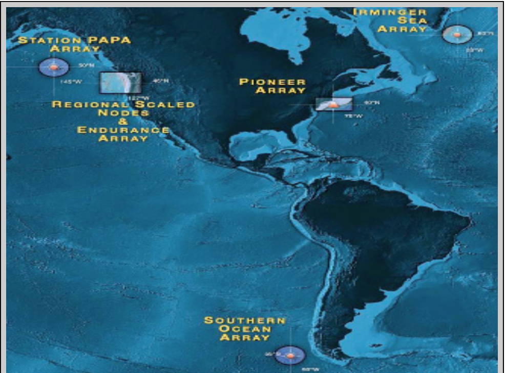
OOI will include global moorings, coastal observatories off both U.S. coasts, and a cabled observatory on off the Pacific Northwest. All will be connected for access to OOI data from anywhere in the world.

IOOS is integrating a number of existing and planned independent open ocean, coastal, and Great Lakes observing efforts to form a "system of systems". This means coordinated data for modeling and advanced products providing close to real time forecasts of ocean conditions. IOOS incorporates various tools - such as buoys, satellites, ships, underwater robots, and high frequency radar stations - to collect ocean observations and