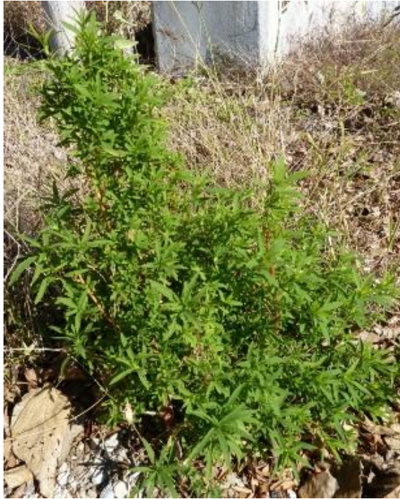
Figure 1. P. Allen Casey. 2009. USDA-NRCS. Kochia that exhibits red colored stems. Found on a disturbed site along a gravel road. Riley County, Kansas

Contributed by: USDA NRCS Kansas Plant Materials Center, Manhattan, Kansas