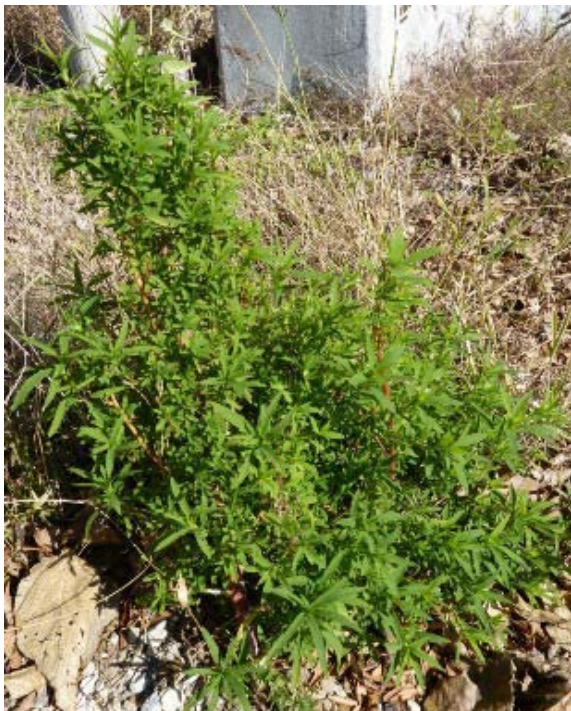
Figure 1. P. Allen Casey. 2009. USDA-NRCS. Burningbush that exhibits red colored stems. Found on a disturbed site along a gravel road. Riley County, Kansas

Contributed by: USDA NRCS Kansas Plant Materials Center, Manhattan, Kansas