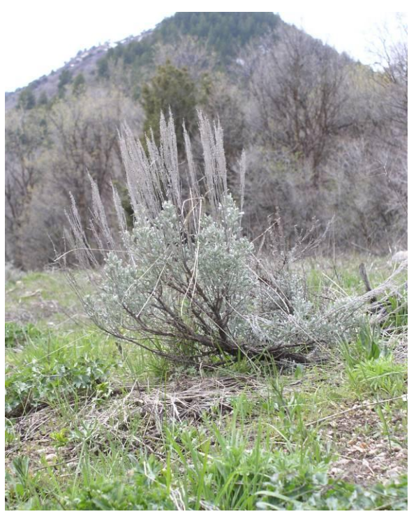
Figure 4 . Even topped mountain big sagebrush.

The vegetative stems of mountain big sagebrush create a characteristic even topped crown with the panicles rising distinctly and relatively uniformly above the foliage (see figure 3). Plants are normally smaller than those of basin big sagebrush, averaging about 0.9 m (3 ft) tall. Inflorescences are narrow and spicate bearing flower heads containing 4 to 8 flowers per head. Leaves are characteristically wider than those of basin or Wyoming big sagebrush. In extracts, ultraviolet visible coumarins are abundant. Leaf extracts fluoresce blue in water and blue-cream in alcohol. 2n = 18 or sometimes 36.