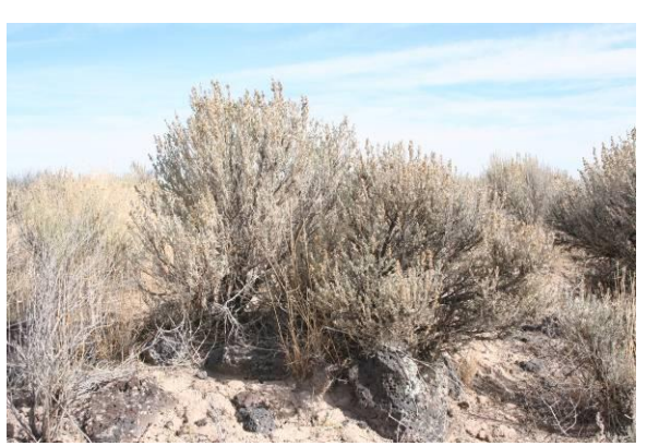
Figure 3 . Wyoming big sagebrush.

Basin big sagebrush usually occurs at the lowest elevational range of the species, being most abundant in the valley bottoms to mountain foothills. Plants typically have a single main trunk and may grow to a height of 4 m (13 ft) under proper conditions, making basin the largest subspecies. Basin big sagebrush plants are generally uneven-topped with loosely branching flowering stems distributed throughout the crown (see figure 1). Floral heads typically contain 3 to 6 small flowers per head. Leaves of the vegetative stems are narrowly cuneate averaging 2 cm (0.8 in) or more and can be as long as 5 cm (2 in) being many times longer than wide (see figure 2). Ultraviolet visible coumarins in leaf extracts are minimal; leaf UV color is none to light blue in water and a rusty red-brown color in alcohol. 2n = 18 or sometimes 36.