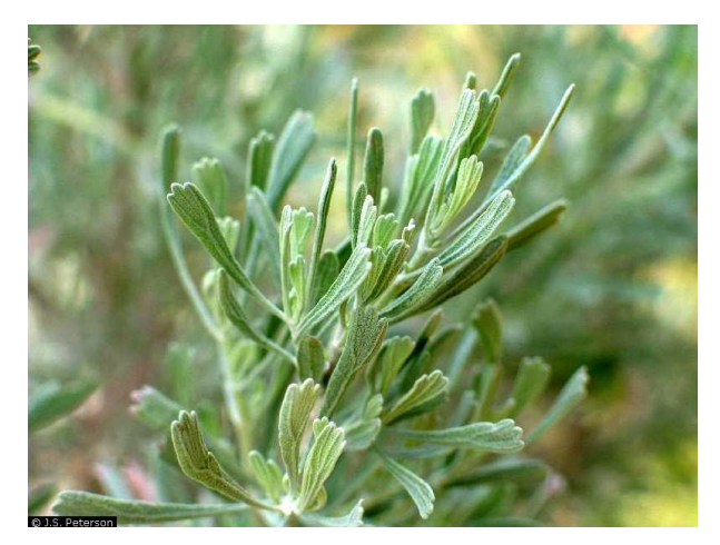
Figure 2 . Leafy stem of basin big sagebrush.

detailed review of the characters for the subspecies occurring in the Intermountain West.