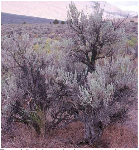
Figure 1 . Basin big sagebrush ( Artemisia tridentata ssp. tridentata ). Photo courtesy of the PLANTS database.

Contributed by: USDA NRCS Idaho State Office