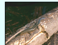
Fig. 6. Southeastern five-lined skink recorded on a transect survey.