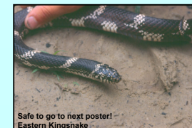
Safe to go to next poster! Eastern Kingsnake