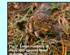
Fig. 7. Large numbers of Rana spp. caused lower diversity ( H' ).