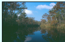
Fig. 3. Milltail Creek, ARNWR.