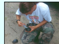
Fig. 5. Incidental capture, measurement, and release of kingsnake and mud turtle.