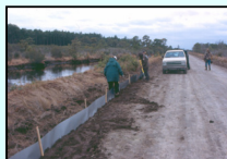
Fig. 4. Drift fence, road, and canal.