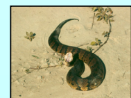
STOP! Eastern Cottonmouth on ARNWR road

Most refuge roads (265 km) parallel canals (Fig. 4), which were created by road building and by draining of surrounding land for planned or former agricultural use (Braswell and Wiley 1982). Although no major streams exist on the eastern side of the refuge, on the western side Milltail Creek (Fig. 3) flows west from the center of the refuge to Croatan Sound (Fig. 1).