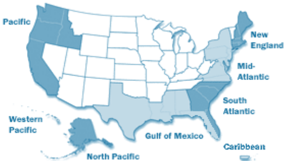
The eight regional fishery management councils

This guide is designed for both those who are unfamiliar with fisheries management as well as those who are already involved in the process. It can be used to guide you through a formal Council meeting, or to get involved in management issues when there is no time to attend Council meetings. The Reference Desk chapter provides contact information, mailing list information, and useful telephone numbers.