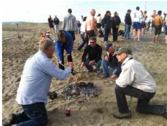
Meeting attendees were treated to a BBQ on the beach, in Nome, complete with a gold panning demonstration.

compressed into 4 new models from the joint plan team. Each of these models addresses at least some concerns by all groups. Model 1 is last year's model. Model 2 is comprised of two unrelated changes: using splines for selectivity and dropping survey data prior to 1982. Model 3 attempts to estimate ageing bias within the model. Model 4 is the same as some that have been used in the past in eliminating most age data. Model 5 is a reconfiguration of the time blocks for selectivity that should simplify the model and result in estimation of fewer parameters. Draft GOA and BSAI Pacific cod assessments using these five models will be reviewed by the teams in August. A draft agenda for the Groundfish Plan Team meetings will be posted on the Council's website by the end of June. Contact Dr. Grant Thompson, NMFS-AFSC, or Jane DiCosimo for more information.