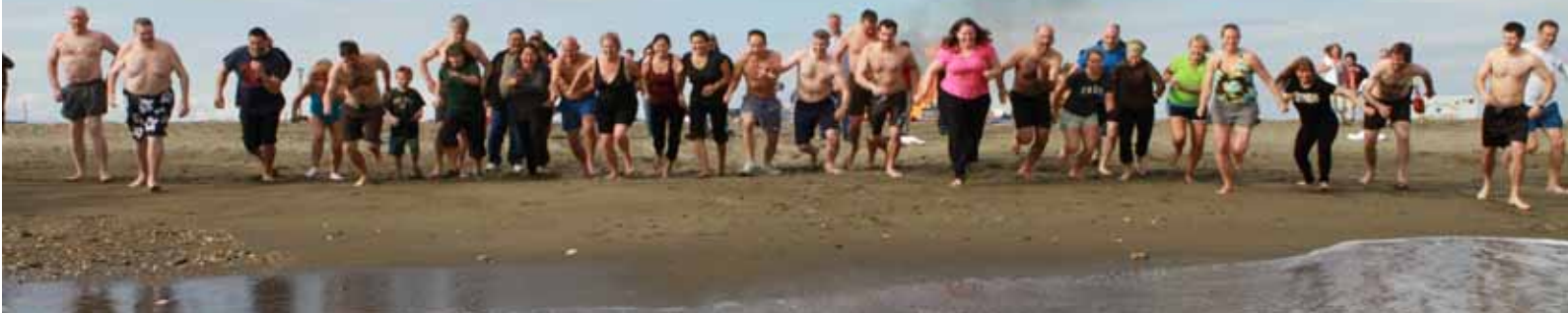
Meeting attendees took a break to participate in the Polar Bear Plunge during the recent Council meeting in Nome.