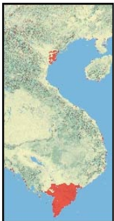
Sea Level Rise Projection; 3m Scenario