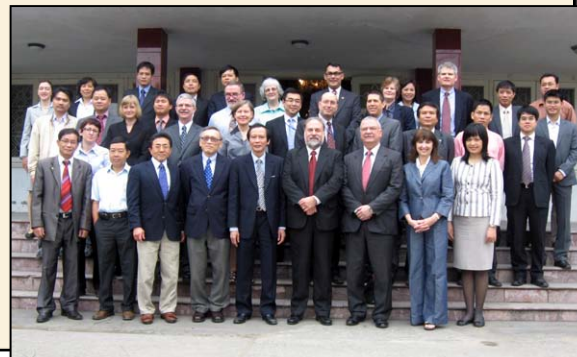
Climate Change Working Group inaugural meeting, March 2010.

The CCWG provides an institutional framework and a network of experts and organizations working on climate change that promotes long-term cooperation between the two countries.