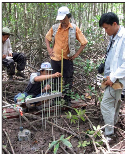
Vietnamese and US scientists installing coastal elevation measuring equipment, in the mangrove forests at Can Gio, to assess coastal vulnerability.

Disaster Risk Reduction: Establish a framework to promote disaster risk reduction through education, training, and projects