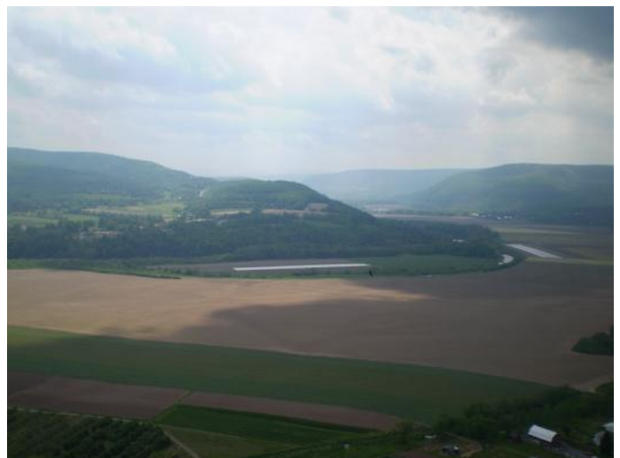
Aerial view, Schoharie County, New York