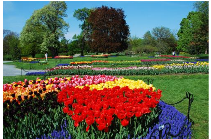
Tulip Festival, Albany, New York