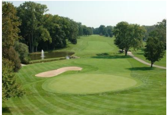
Troy Country Club, Brunswick, New York