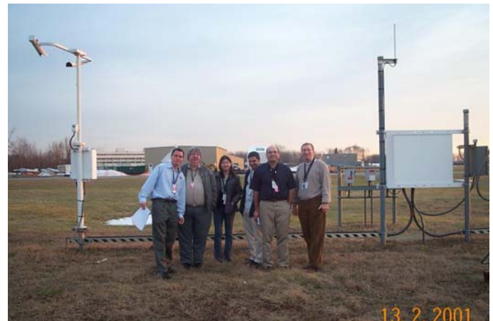
NWS Albany personnel with Albany International Airport's Automated Surface Observing System (ASOS) in the background (1/8/08).