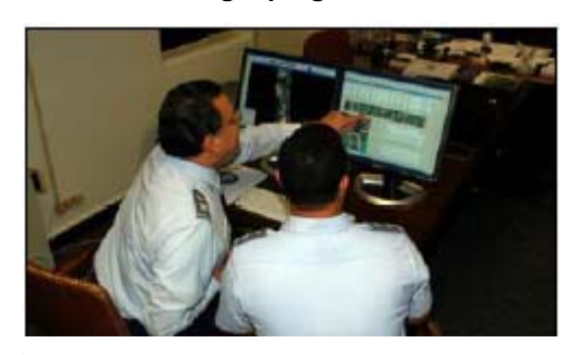
The information collected by the airborne ARCHER system can be analyzed further at the ARCHER ground station.

Contact the CAP National Operations Center at 888-211-1812, ext.300 in an emergency, or email opscenter@capnhq.gov for routine requests for support or information.