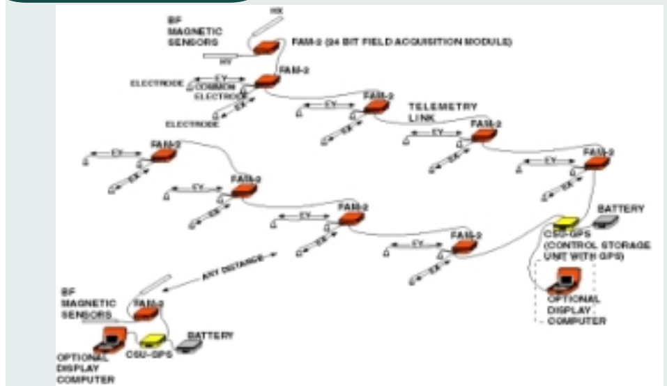
MT-24 field setup for Natural IP.