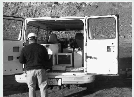
LIBS instrument (left) performing analysis at mine site (right).