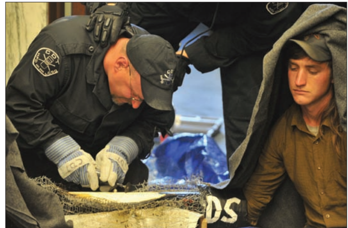
Helena law enforcement take measures to defeat protester devices designed to disrupt and delay daily operations at the state capitol. Law enforcement have said CDP training led to their successful response.

The CDP offers three Field Force Courses. Field Force Operations prepares law enforcement to employ crowd control measures and civil disorders; Field Force Command and Planning is designed for management-