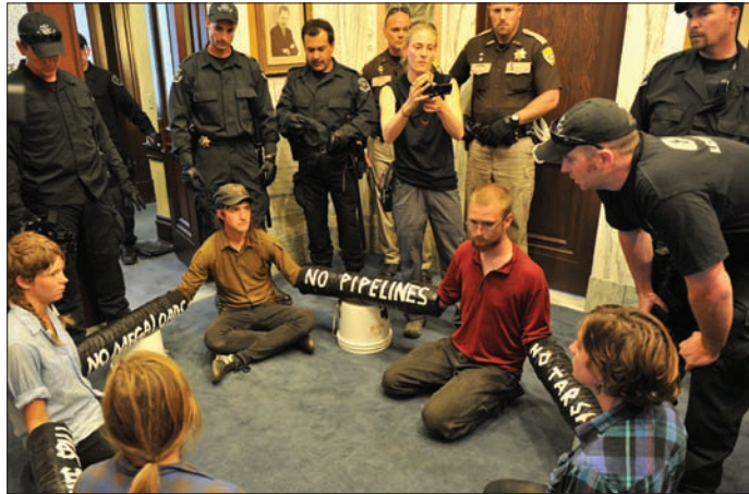
Local law enforcement prepare to remove protesters from the Montana state capitol in July 2011.

The protesters used five devices to link themselves together. Each device would have to be removed before police could arrest anyone. All the while, chants and loud drumming from the other 60-plus protesters