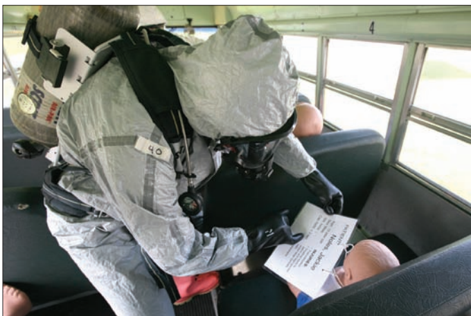
A first responder arriving to a simulated accident scene involving a school bus quickly reads a symptoms card to properly triage potential survivors.