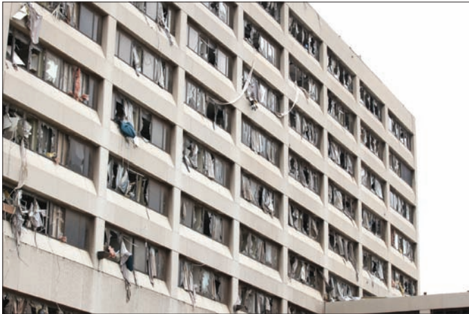
The exterior windows of St. John's Regional Medical Center displays the danger patients and workers experienced.

JOPLIN, Mo.—In May 2011, as tornado sirens sounded, hospital workers at St. John's Regional Medical Center, in Joplin, Mo., rushed to pull 183 patients to safety as one of the largest tornadoes on record bared down on their southwestern Missouri city. Breaking glass and the roar of the powerful storm deafened the dark hospital as power was lost.