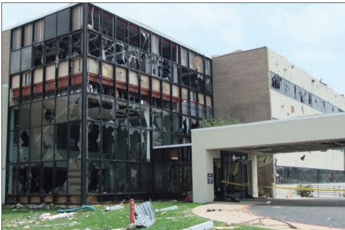
The main entrance and lobby of the St. John's administrative building shows the remnants of shattered glass and flying debris.