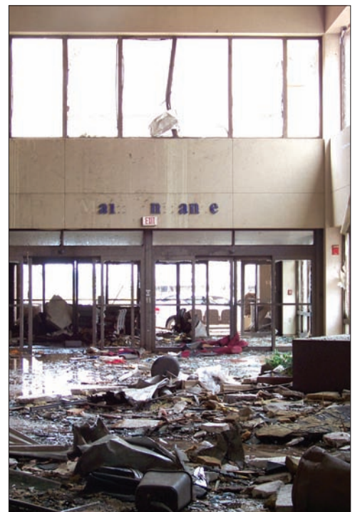
The interior of St. John's main entrance provides an example of the destruction inside the hospital.