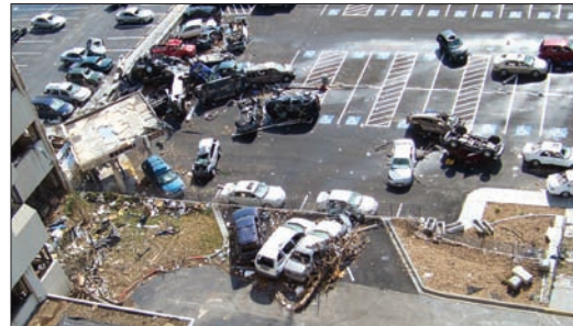
Vehicles tossed by the storm litter St. John's parking lot.

"The CDP training helped me fulfill my role with