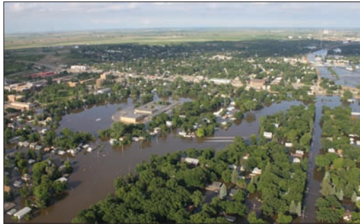
The city of Minot, N.D. experienced the worst flooding in over 130 years in June 2011.