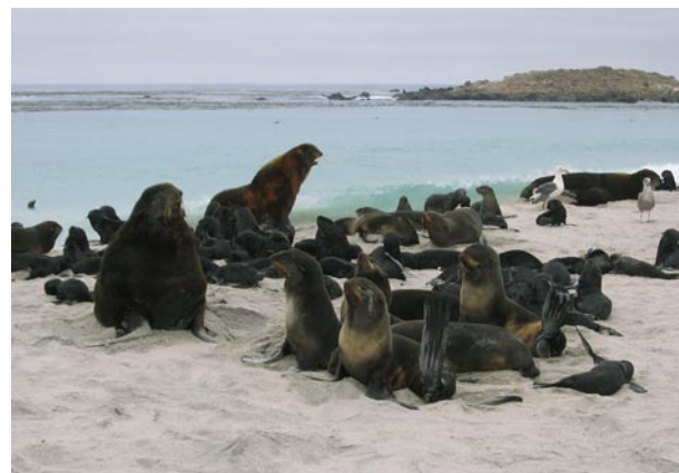
Figure 1. Reproductive territories of northern fur seals on Adams Cove beach, San Miguel Island, July 2006.