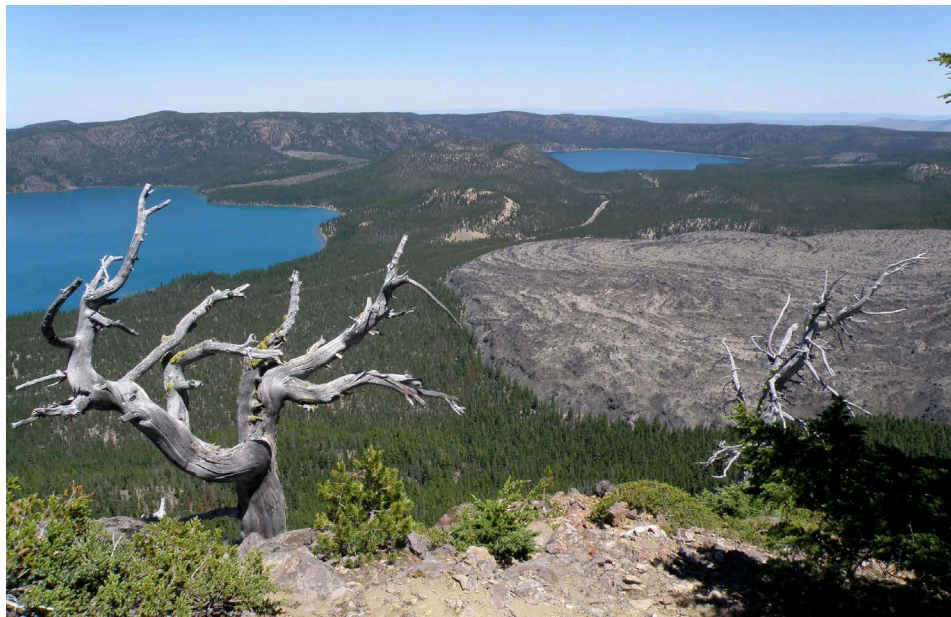
Newberry Volcano, Oregon, is the largest volcano in the Cascades volcanic arc. This north-facing view taken from the volcano’s peak, Paulina Peak (elevation 7,984 feet), encompasses much of the volcano’s 4-by-5-mile-wide central caldera, a volcanic depression formed in a powerful explosive eruption about 75,000 years ago. The caldera’s two lakes, Paulina Lake (left) and the slightly higher East Lake (right), are fed in part by active hot springs heated by molten rock (magma) deep beneath the caldera. The Central Pumice Cone sits between the lakes. The mostly treeless, 1,300-year-old Big Obsidian Flow, youngest lava flow on the volcano, is surrounded by forest south of the lakes.

H idden in plain sight, Oregon’s massive Newberry Volcano is the largest volcano in the Cascades volcanic arc and covers an area the size of Rhode Island. Unlike familiar cone-shaped Cascades volcanoes, Newberry was built into the shape of a broad shield by repeated eruptions over 400,000 years. About 75,000 years ago a major explosion and collapse event created a large volcanic depression (caldera) at its summit. Newberry last erupted about 1,300 years ago, and present-day hot springs and geologically young lava flows indicate that it could reawaken at any time. Because of its proximity to nearby communities, frequency and size of past eruptions, and geologic youthfulness, U.S. Geological Survey scientists are working to better understand volcanic activity at Newberry and closely monitor the volcano for signs of unrest.