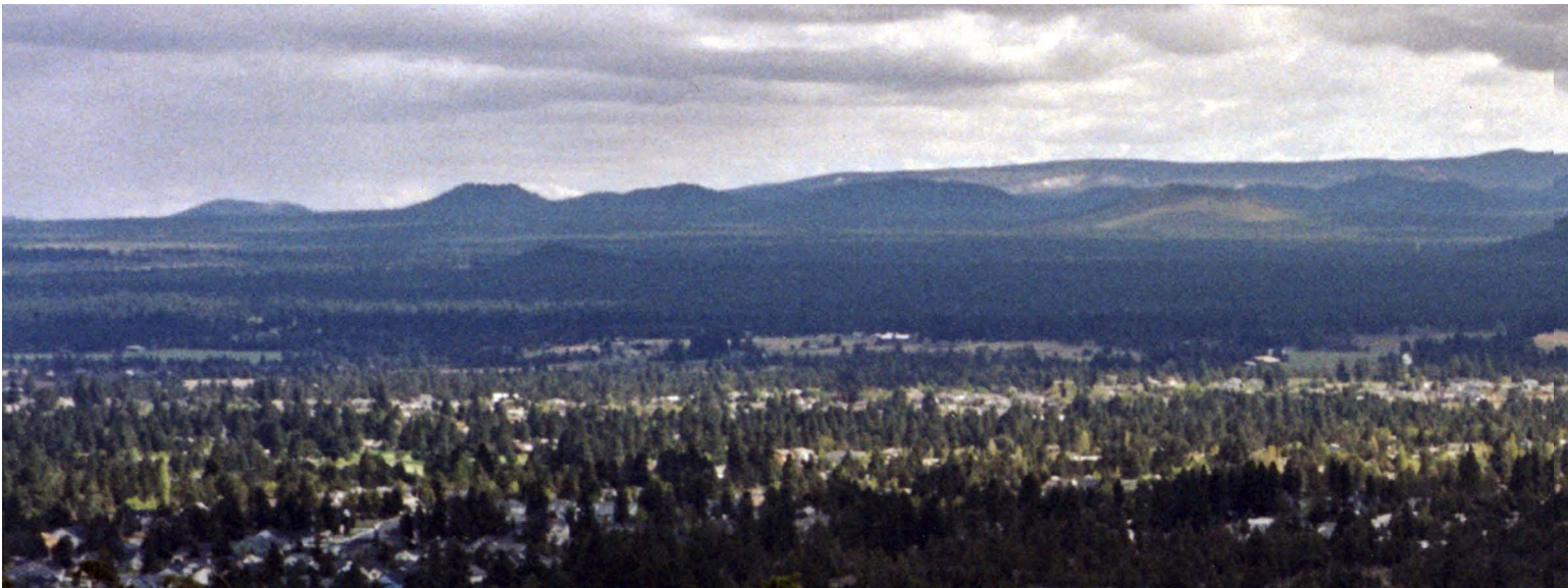
Looking south from Pilot Butte in Bend, Oregon, the broad shield of Newberry Volcano rises nearly 4,000 feet above the city and the surrounding high-desert terrain. Because this giant volcano does not have the typical cone shape of most Cascades volcanoes and appears to be a small range of low mountains, most people do not recognize this sleeping giant as a volcano. The high-standing part of Newberry covers about 40 miles north-south by 25 miles east-west. Numerous cinder cones (conical hills formed of cooled blobs of frothed lava) are scattered across the flanks of the shield, evidence of repeated volcanic activity.

about 40 miles north-south by 25 miles east-west and encompasses nearly all of the volcano's vents. However, Newberry's lava flows extend much farther than this high part and to the north include the area of what is now downtown Bend, as well as the Redmond Municipal Airport. About 350,000 years ago, an early lava flow erupted from Newberry and flowed north until it reached Smith Rock, where it filled and moved down the channel of the Crooked River and also shifted the channel of the Deschutes River.