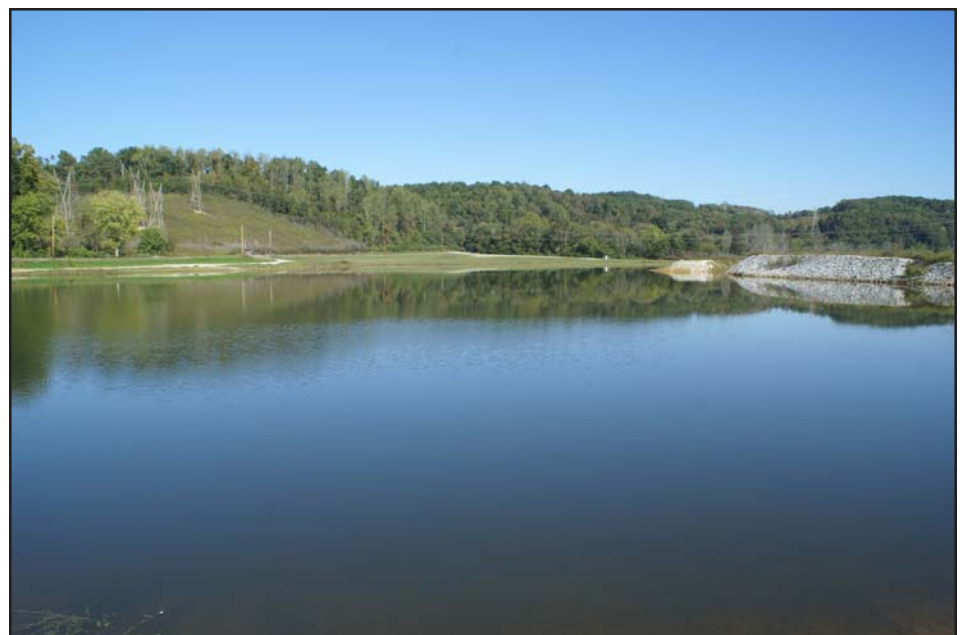
Natural spring water now fills the northern reaches of the north embayment.