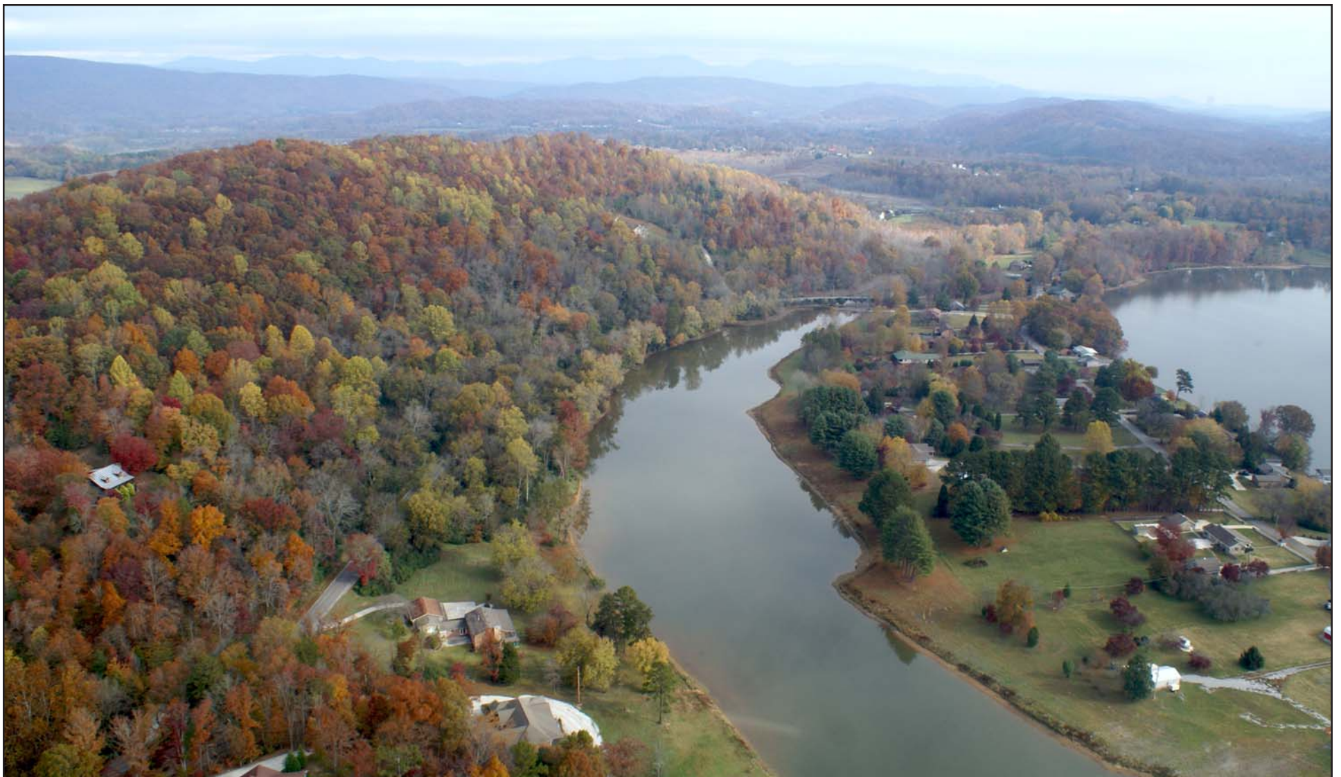
An aerial view of the east embayment and Lakeshore Drive shows the significant progress made at the Kingston Ash Recovery Project to date.

The photos below highlight some of the progress we've made to date.