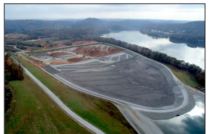
This aerial view shows the progress made on the lined gypsum pond at the Kingston Fossil Plant.

If you have questions or comments for our Community Relations staff, please contact us at (865) 717-1635, or email us at kingstoncomm@tva.gov .