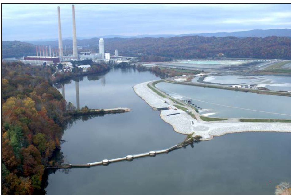
The newly constructed skimmer wall at the mouth of the intake channel and Dike C are now complete.