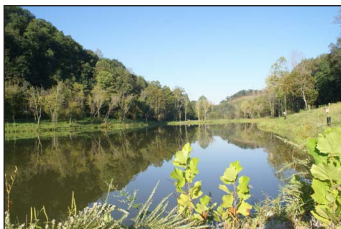
Left, a Great Blue Heron flies along the bank of the water-filled north embayment. Above, the church slough was one of the first of many success stories at the Kingston Ash Recovery Project.