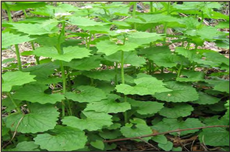
Tumtuluteng nulalriit Garlic Mustard-at nalkumallret Alaska Native Brotherhood Hall-am caniani Juneau-mi. Tamaqurmiut caliut cagnairutellrata nunameng avatiitnun tungiinun.

A thick patch of garlic mustard found near the Alaska Native Brotherhood Hall in downtown Juneau. The local community is working to ensure that it does not spread into the native forest.