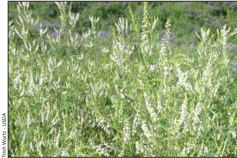
Trish Wurtz - USDA

The sweetclovers are tall members of the same plant family as lupine and Eskimo potato, and have either white or yellow flowers. Both white and yellow sweetclover normally reproduce every other year, but have been found to flower and produce seed after one growing season in Alaska, possibly due to the long hours of daylight during summer months. The sweetclovers alter soil chemistry through a chemical that is toxic to grazing animals and livestock, and produce their own fertilizer. Sweetclover has spread along the road system throughout interior Alaska, and efforts are currently underway to prevent its spread along rivers that cross the road system.