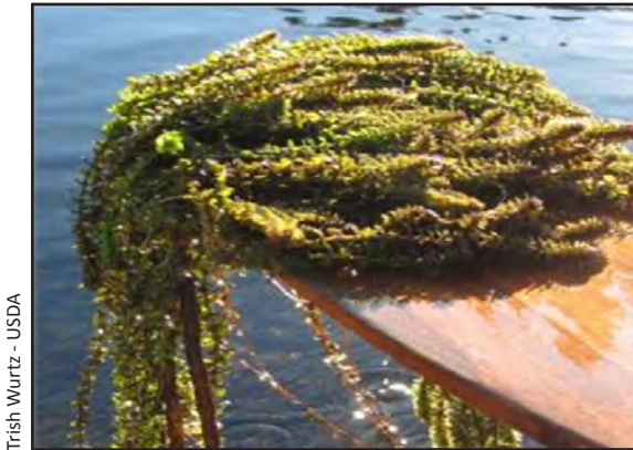
Trish Wurtz - USDA

Waterweed is a submerged aquatic plant found in slow-flowing waters in the continental US and British Columbia, Canada. Waterweed is a very delicate plant, when picked up it easily breaks into pieces, and floats away. Each piece is capable of growing into a new plant. It has the ability to completely obstruct and fill a stream channel or lake in as few as 3 to 5 years after introduction. It can survive frozen in ice, and spread downstream into other wetlands during ice flows and flood events. The sheer amount of vegetation that can occur in just a few years can cause major changes to the freshwater streams and lakes that many fish depend on. An infestation was discovered near Fairbanks, Alaska in 2009, and has spread into the Chena River. Waterweed fragments have the potential to spread downstream into the Tanana and Yukon drainages, and into lakes, streams and sloughs during flood events. Riverboats and float-planes could also help waterweed move into new areas.