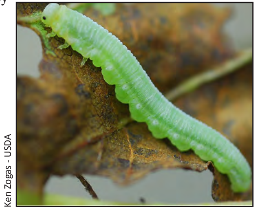
Ken Zogas - USDA

The adult sawflies look like small black and white striped wasps and are difficult to distinguish from native insects. The larvae are commonly found feeding on the underside of thinleaf alder in early and mid-spring. They can also be found in small holes which they create in rotten wood to protect them from the cold during winter.