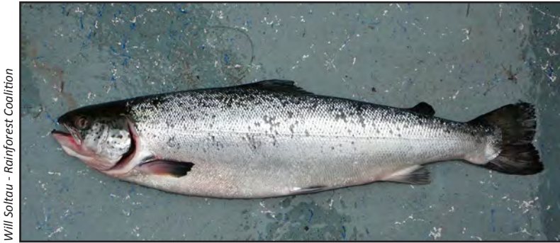
Will Soltau - Rainforest Coalition

This species of salmon is thought to be a threat to native salmon in several ways, including the spread of diseases and parasites, taking over the breeding grounds of other salmon species, eating other salmon species, out-competing other species for resources, and potentially interbreeding with native species. All of these potential impacts would have serious economic, subsistence, and ecological consequences to people and communities dependent on Alaskan salmon populations.