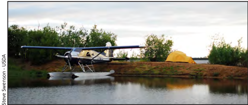
Steve Swenson - USDA

The threat invasive species pose to the natural ecosystem has been recognized for most of the last century. During this time, Alaska has been protected by its remote location, cold climate, and its small human population. But in the last 20 years, things have changed. There are now approximately 100 invasive species in Alaska, and more are arriving every year. These organisms are tough and can survive the cold Alaskan winters. They are being spread by people, both intentionally and unintentionally, over great distances. There are invasive species throughout Alaska: Garlic mustard and knotweed in southeast Alaska, pike and reed canarygrass scattered across the Kenai Peninsula, and white sweetclover spreading north along the Dalton Highway. Alaska is unique amongst the states in that these populations are small and scattered. There is still an opportunity to prevent invasive species from reaching most of Alaska and to contain the existing populations. But this can only be done by increasing awareness and combining efforts across the state. The people of southwestern Alaska can be a critical part of the fight against invasive species.