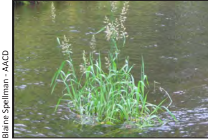
Blaine Spellman - AACD

Reed canarygrass can be distinguished from other native grasses by two characteristics. It often is taller than most native grasses, reaching heights of up to 5 feet. It also has a tendency to remain green later into the fall than the grass native to Alaska.