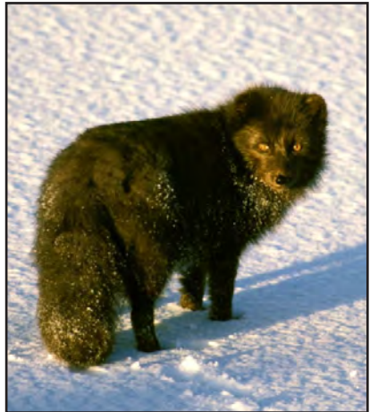
Steve Ebbert - USF&WS

The Aleutian cackling Canada goose was once reduced to only a few fox-free Aleutian Islands and listed as an endangered species, but was successfully reintroduced to some islands after fox eradication. This invasive species eradication and island restoration effort helped achieve full recovery of this unique goose and enabled its removal from the endangered species list. The fox eradication project is one part of the Alaska Maritime National Wildlife Refuge's effort to eradicate invasive species to restore island ecosystems and their natural biodiversity.