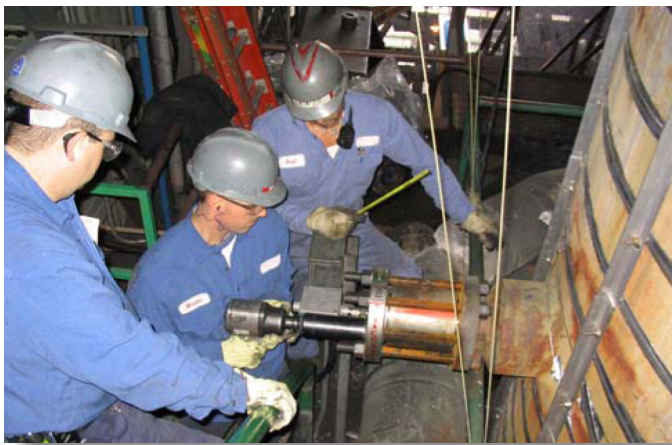
Test thermocouples being installed in a commercial gasifier.

In addition to the improved refractory, an NETL-designed thermocouple assembly is also being developed with the goal of providing longer and more consistent temperature measurement to the gasifier operator, leading to better operational control of the system.