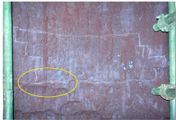
Test panel inside the gasifier just prior to removal. The circled area is the origin of the two bricks illustrated on page one.

Field tests to date have been run at the Eastman Chemical Company's Kingsport, TN, site; at Tampa Electric Company's Polk Power Station in Lakeland, FL; and at the Wabash River Power Station in Terre Haute, IN. Funding for this project comes via the Department of Energy, Fossil Energy's Advanced Gasification Technologies and Advanced Research—Materials technology lines.