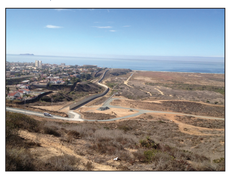
Tijuana Mexico and U.S.-Mexico Border overlooking the Tijuana drainage. This area is particularly challenging due to incomplete fencing, steep terrain, canyons, and frequent dense fog.