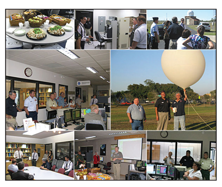
Partners Appreciation Day.

The first tour took visitors outside to learn how NWS collects observations from the Automated Surface Observing System and upper air radiosonde/weather balloon releases. The tour included an