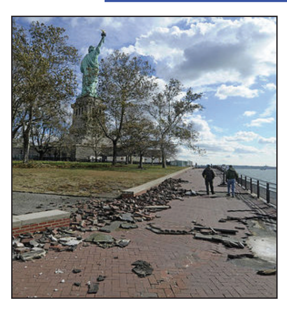
Brick pavers dislodged from Sandy's storm surge.