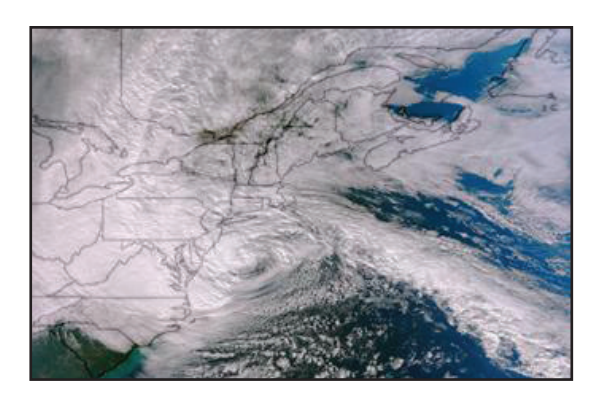
Satellite image of Hurricane Sandy: This Suomi satellite image shows Sandy along the Mid-Atlantic coastline with its center about 125 miles southeast of Atlantic City, NJ. Sandy was within several hours of landfall on the southern New Jersey coastline.