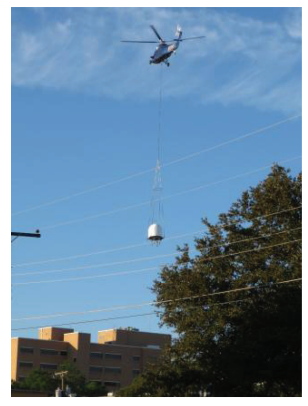
Helicopter delivery of first CASA radar unit to University of Texas-Arlington Campus.

As part of a 10-year, $40 million demonstration project funded by a <u>National Science Foundation</u> grant, the CASA concept has already been tested successfully in a rural Oklahoma setting. "The data from the Oklahoma phase of the project has already