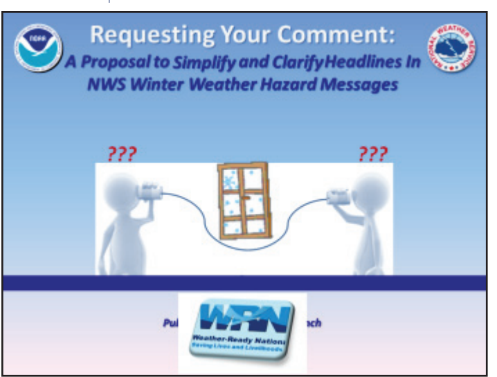
Watch a brief narrated slide show to learn more about this test.

In support of our Weather-Ready Nation initiative, NWS wants to start a conversation on how to simplify and clarify our products. NWS uses the terms Watch, Warning, and Advisory (WWA) to describe how likely we believe a weather or flooding event is to occur, how severe we think the associated